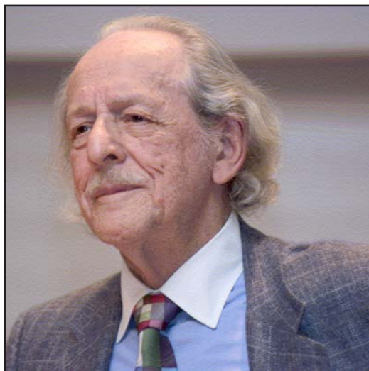
Eugene Garfield in 2007.

Dr. Eugene Garfield, the founder of the Institute for Scientific Information (ISI) (now Clarivate Analytics), and the intrepid entrepreneur who created ground-breaking products such as Current Contents , the Science Citation Index , Index Chemicus , and Current Chemical Reactions , died unexpectedly on February 26, 2017.