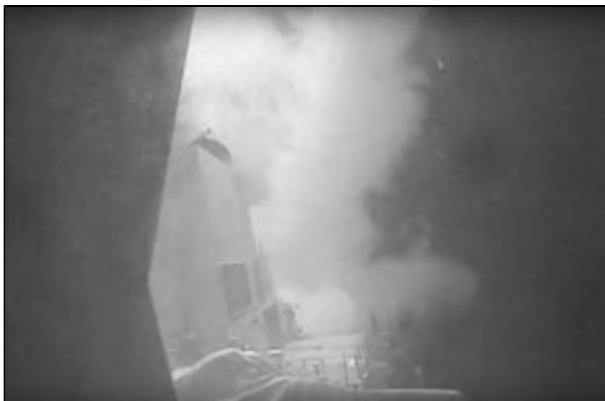
A Tomahawk Land Attack Missile Launched from USS Nitze against Houthi-Saleh radar.

Claiming self-defense, the USS Nitze fires Tomahawk cruise missiles at three Houthi-Saleh-controlled radar installations, A Pentagon spokesperson says, "These limited self-defense strikes were conducted to protect our personnel, our ships and our freedom of navigation in this important maritime passageway," Other U.S. officials reiterate that U.S. actions do not indicate deeper U.S. support for the Saudi-led coalition or deeper military involvement in the conflict.