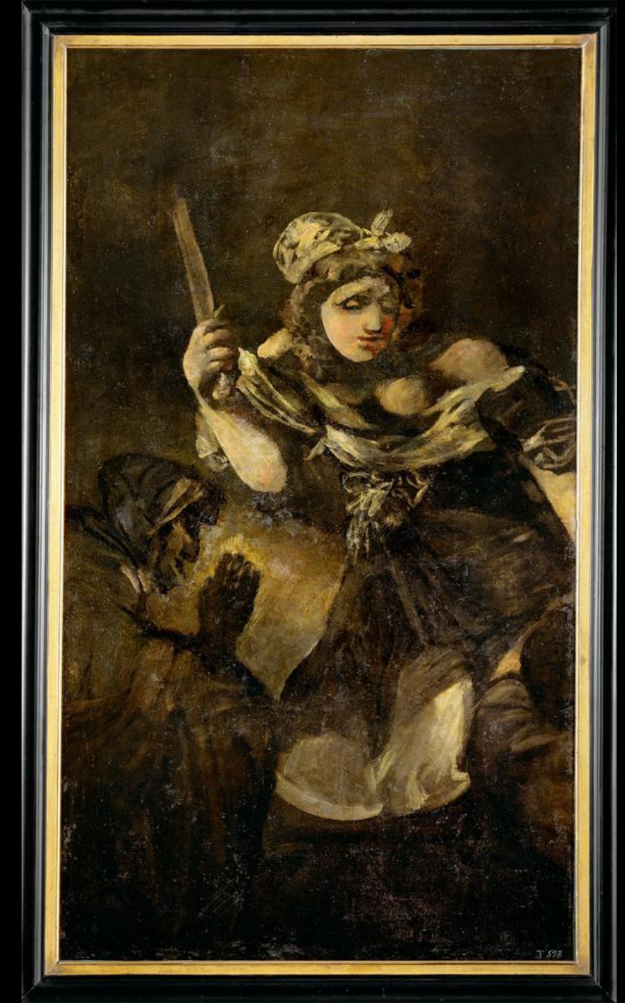
Figure 4. Goya, Francisco. Judith and Holofernes . 1819-23. Painting.