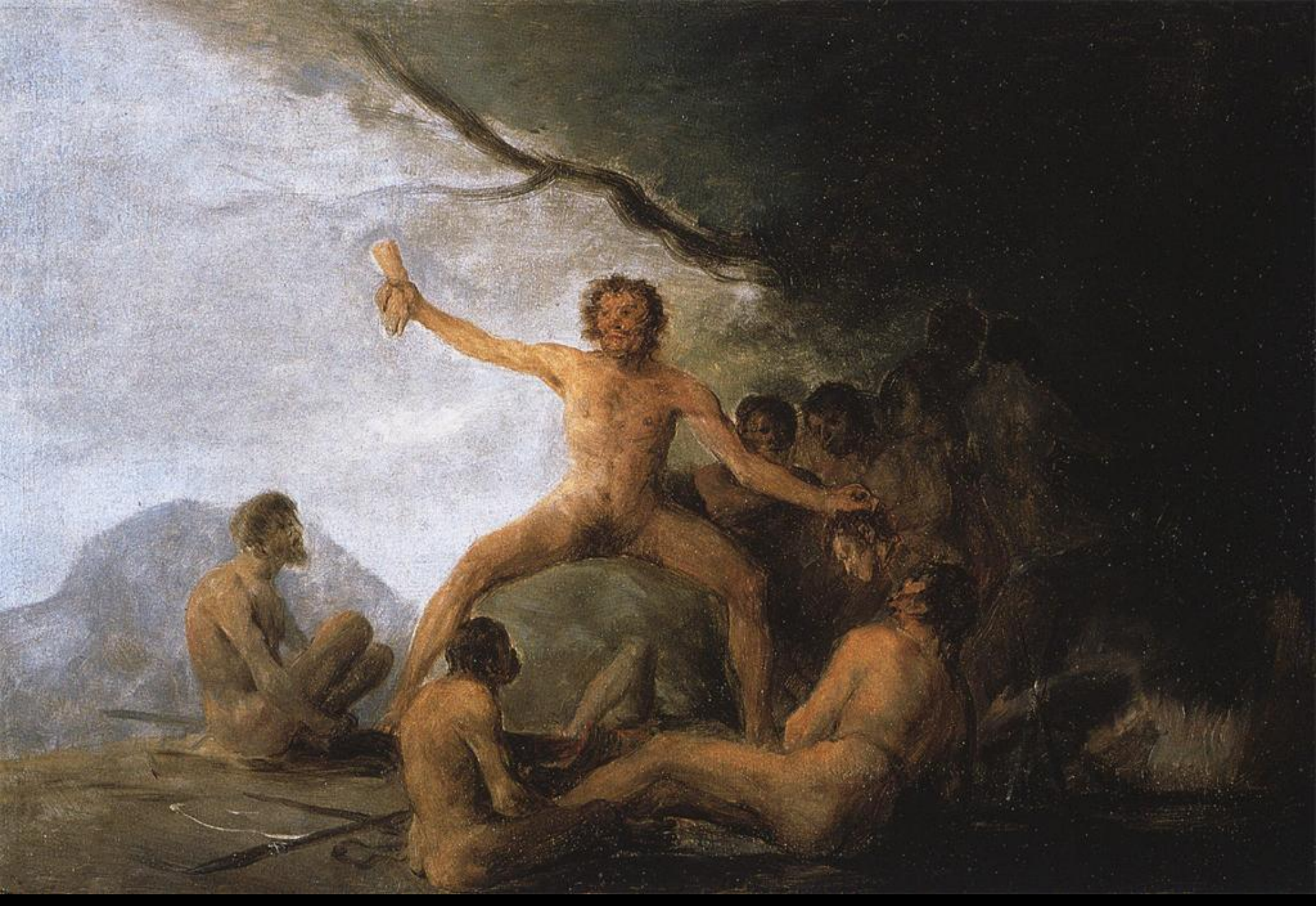
Figure 2. Goya, Francisco. Cannibals Contemplating Human Remains . 1800-8. Oil on wood. 32.7x47.2cm.