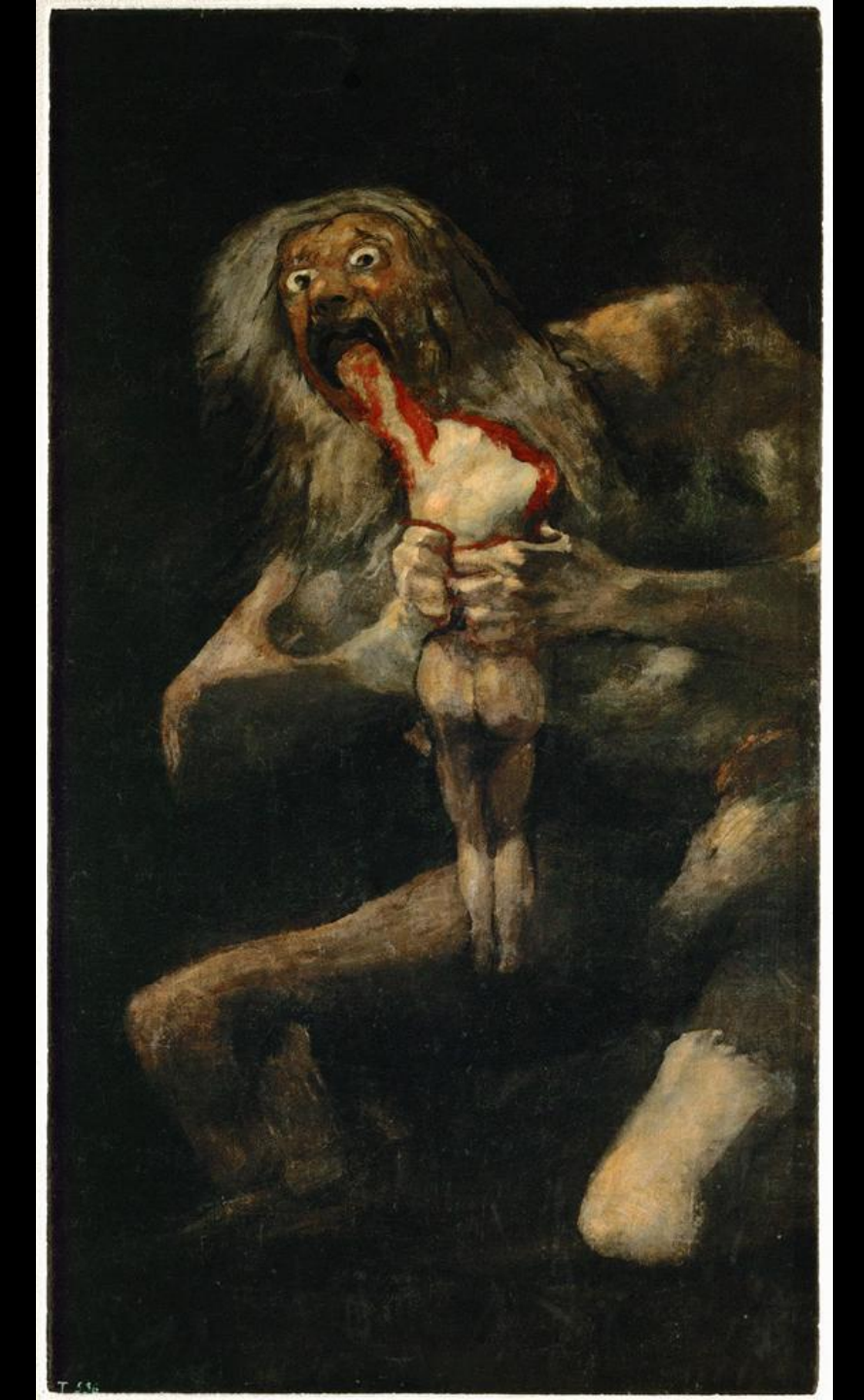
Figure 3. Goya, Francisco. Saturn devouring one of his Sons . 1820-23. Mural Transferred to canvas. 1460 x 830 mm.