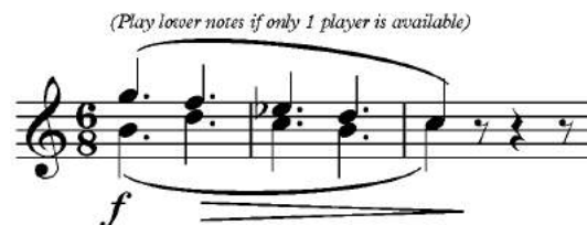
Figure 5. Paul Fauchet, Symphonie pour Musique d'Harmonie , Movement 1 "Overture," mm. 111-112, performance edition. Editorial note added in clarinet 2/3 part (and also in the full score) indicating note preference if only one player is available. © COPYRIGHT 1926, 1933 (Copyrights Renewed) WB MUSIC CORP. Reproduced by permission of Alfred Publishing Co., Inc.

flat clarinets, and two bass clarinets). Although it is recommended to have multiple players on each clarinet part (particularly the B-flat parts), in order to match the sonority likely envisioned by the composer, all parts can be covered with a minimum of two, and in many cases, one player per part if fewer players are available. The E-flat clarinet parts remained the same, with the divisi parts unchanged. A total of forty-six measures in all of the movements contain divisi E-flat clarinet parts and they are all doubled in appropriate octaves within other instrumental voices. The B-flat clarinet parts remain primarily intact from the 1926 publication. Some divisi clarinet moments were extracted and added to clarinet parts that were not playing at that time (an example is the first movement, mm. 175-176, where clarinet 1 notes were added to the clarinet 2 parts since they contained rests during the same passage). A clarinet 4 part was added in the fourth movement to cover the additional clarinet part added in the fourth movement of the 1926 edition. Due to the divisi passages in the clarinet writing, suggestions have been made in the parts and score for which note to eliminate if only one player is available per part. Figure 5 shows an example an example of this as found in the clarinet 2 part of the first movement (mm. 111-112).