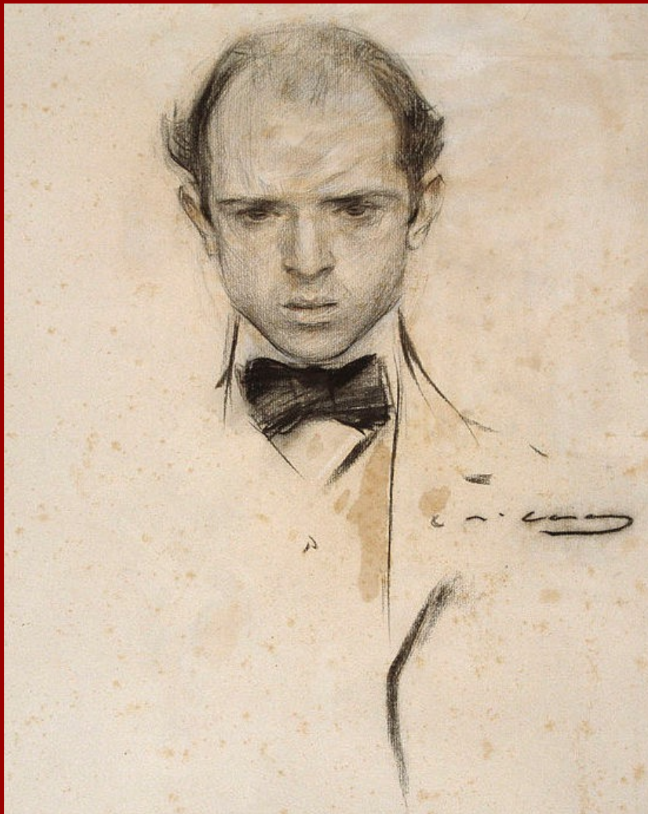
Undated portrait by Ramon Casas i Carbó (Museu Nacional d'Art de Catalunya)