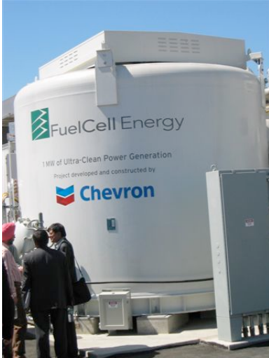
Fig. 2. The 1 MW Fuel Cell at Santa Rita Jail The fuel cell at the jail was intended to provide a consistent base load of 1 MW. The fuel cell’s performance has not been good. In fact, it produced at a 100% capacity factor in only one month over the 2007-2009 period. The missed 2009 bill savings resulting from less-than-perfect performance are shown in Figure 3.

from the PV system, with the exception of a single month in 2007, has not exceeded 700 kW in recent years.