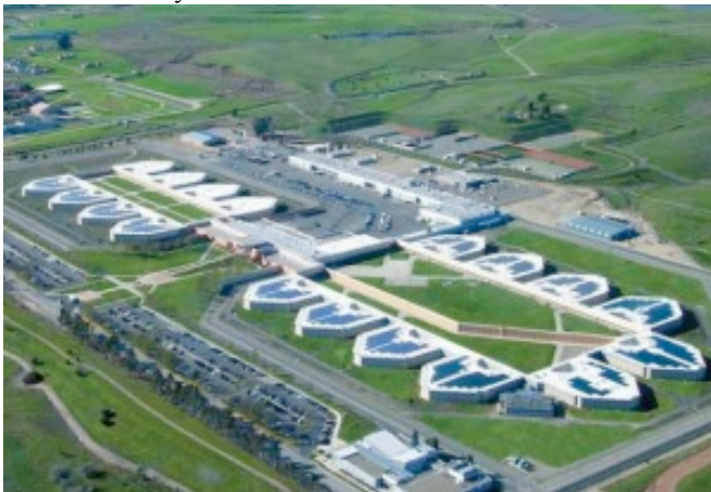
Fig. 1. Jail Aerial View

A large microgrid project is nearing completion at Alameda County's twenty-two-year-old 45 ha 4,000-inmate Santa Rita Jail, about 70 km east of San Francisco. Often described as a green prison , it has a considerable installed base of distributed energy resources (DER) including an eight-year old 1.2 MW PV array, a five-year old 1 MW fuel cell with heat recovery, and considerable efficiency investments. Fig. 1 is an aerial depiction of the Jail with the PV rooftop modules clearly visible.