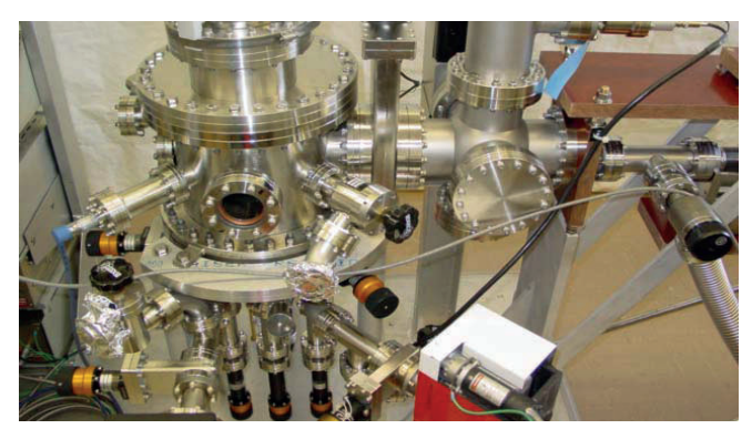
Figure 4. A photograph of the second generation deposition system.

The second generation system; [3] used a smaller chamber, less material, had a lower out gassing rate and better vacuum. There is a shorter sourcesubstrate distance with isolated getter sources, which are quick to heat allowing fast photocathode preparation. The sources are pre-made commercially available sources from SAES getter. The system allowed for co-deposition of cathode materials, better photocathodes and deposition on metal or transparent substrate. The second generation system is yielding very positive results but does not address the transportation of the cathode to the SRF Gun. A photograph of the second generation deposition system is shown in figure 4.