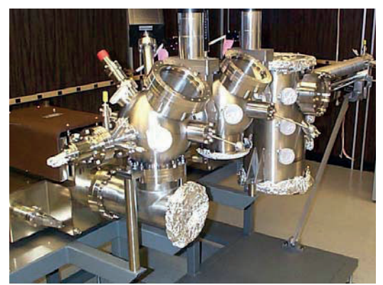
Figure 3. A photograph of the first generation deposition system.

The first generation system shown in figure3.had some positive results; [3] QE at various wavelengths were measured, uniform emission over 1" diameter cathodes was demonstrated, favorable lifetime measurements, and favorable high current density measurements were also obtained.[4] The deposition system consisted of three ultra high vacuum chambers, deposition, storage and testing chambers in series, separated from each other by gate valves. The deposition chamber contained four 3 cc molybdenum crucibles that could be heated up to 800^{\circ} C. The substrate was held at the end of a linear translator that could move between the deposition, storage and test chambers. The lessons learned in the first generation system were; [3] the system was too large and cumbersome for our needs, the packed powder samples could not be heated quick enough, the time between deposition of different materials was too long and there was the concern of cross contamination of sources.