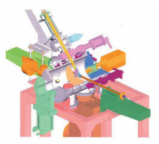
Figure 1. A cutaway view of the third generation multi-alkali deposition system.

In describing the photocathode deposition system; [1] it has deposition sources for Cs, K and Sb, it is all metal construction including gate valves-all bakeable to 250^{\circ} C, it has adequate pumping (250 l/s ion pump with 2 NEG's) with a measured base pressure of 2x10^{-10} torr or better after bakeout. It has a radiant heater for cathode tip cleaning, a quartz crystal balance for measuring the deposition rate from the