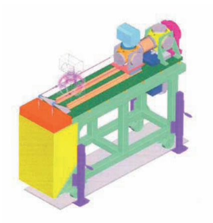
Figure 2. A view of the transport cart.

The transport cart shown in figure 2; [1] has two vacuum crosses separated by a long stroke bellows, has adequate pumping (200 l/s ion pump on the front cross, 40 l/s ion pump on the rear cross with additional NEG's) with an expected base pressure of 10<sup>-10</sup> torr or better after bakeout. It is all metal construction including valves-all bakeable to 250<sup>o</sup>C. Additionally there are two transport carts that have been fabricated thus allowing for quick turn around when changing a cathode out of the injector, or while the ERL is operational.