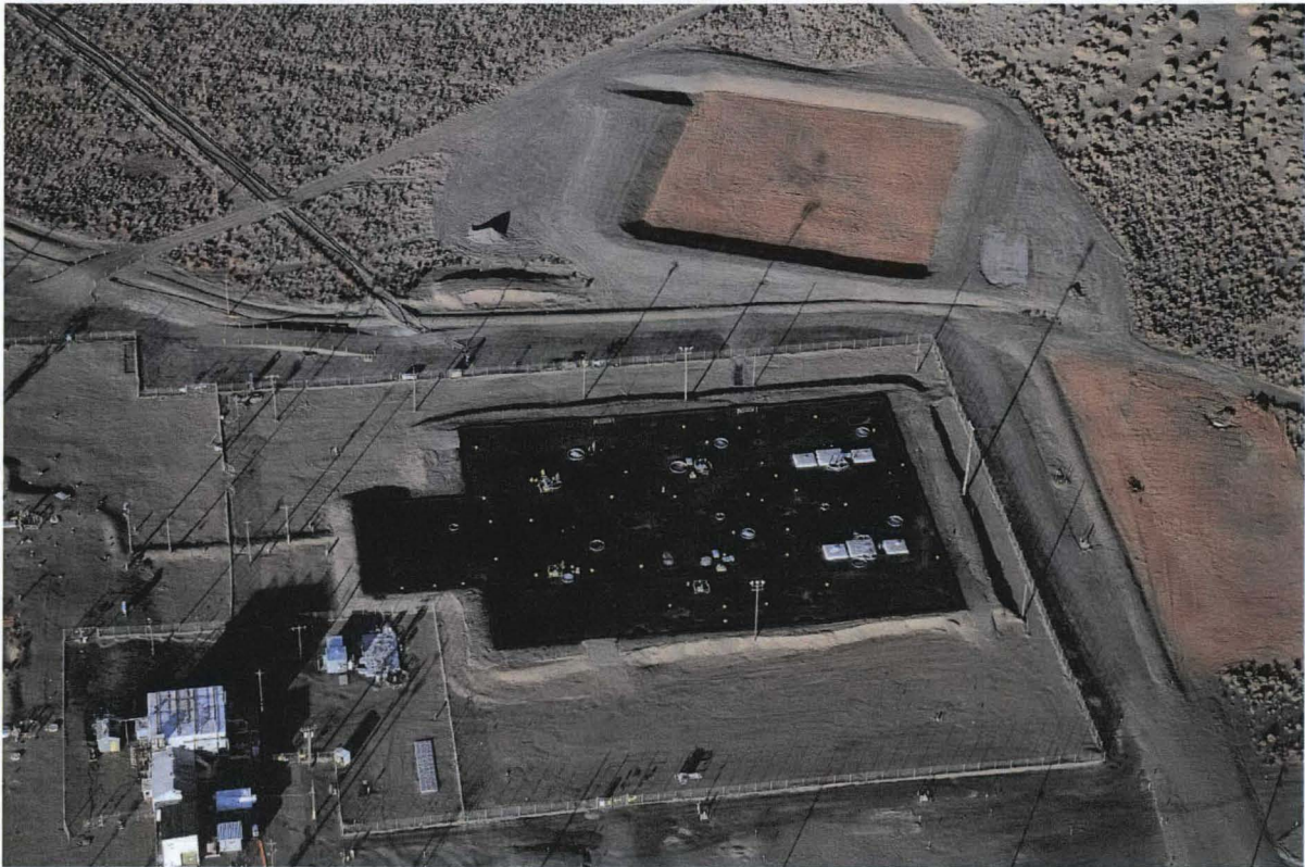
Fig. 8. Photograph of final barrier.