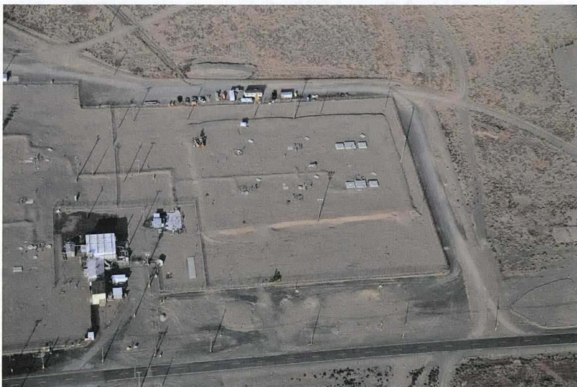
Fig. 1. Aerial photograph of TY barrier before barrier.

In addition, TY Tank Farm was classified as “controlled, clean, and stable.” The controlled clean and stable process included steps to reduce worker exposure to hazards [4], and applied at TY Tank Farm resulted in a relatively clean level gravel surface within the farm. This clean, level, gravel surface allowed the emplacement of an interim barrier with a minimum of leveling of the farm, as well as with a minimum of radiological hazards to contend with during construction.