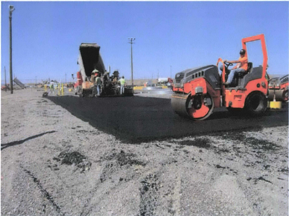
Fig. 7. Photograph of asphaltting.

Asphalt placement was through the use of standard commercial asphalt equipment. This allowed for rapid completion of the barrier which is a significant advantage over other materials that require significant amount of handwork or time to install. Again, spotters were used to ensure there was no damage to tank farm equipment, and to ensure personnel safety.