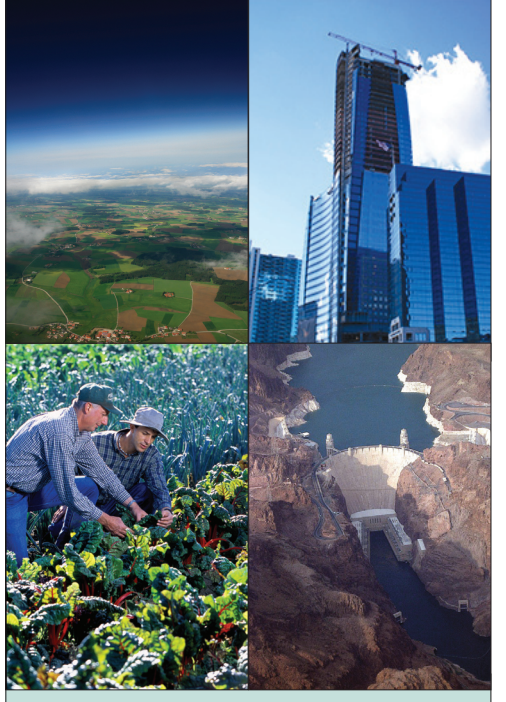
Figure 1. The users of climate data are diverse, including city planners, energy producers, and farmers.

However, as the effects of climate change become more apparent— with potential impacts including sea-level rise, an ice-free Arctic in some seasons, and large scale ecosystem changes— past conditions will no longer serve as reliable predictors of future climate events. Climate change could increase the