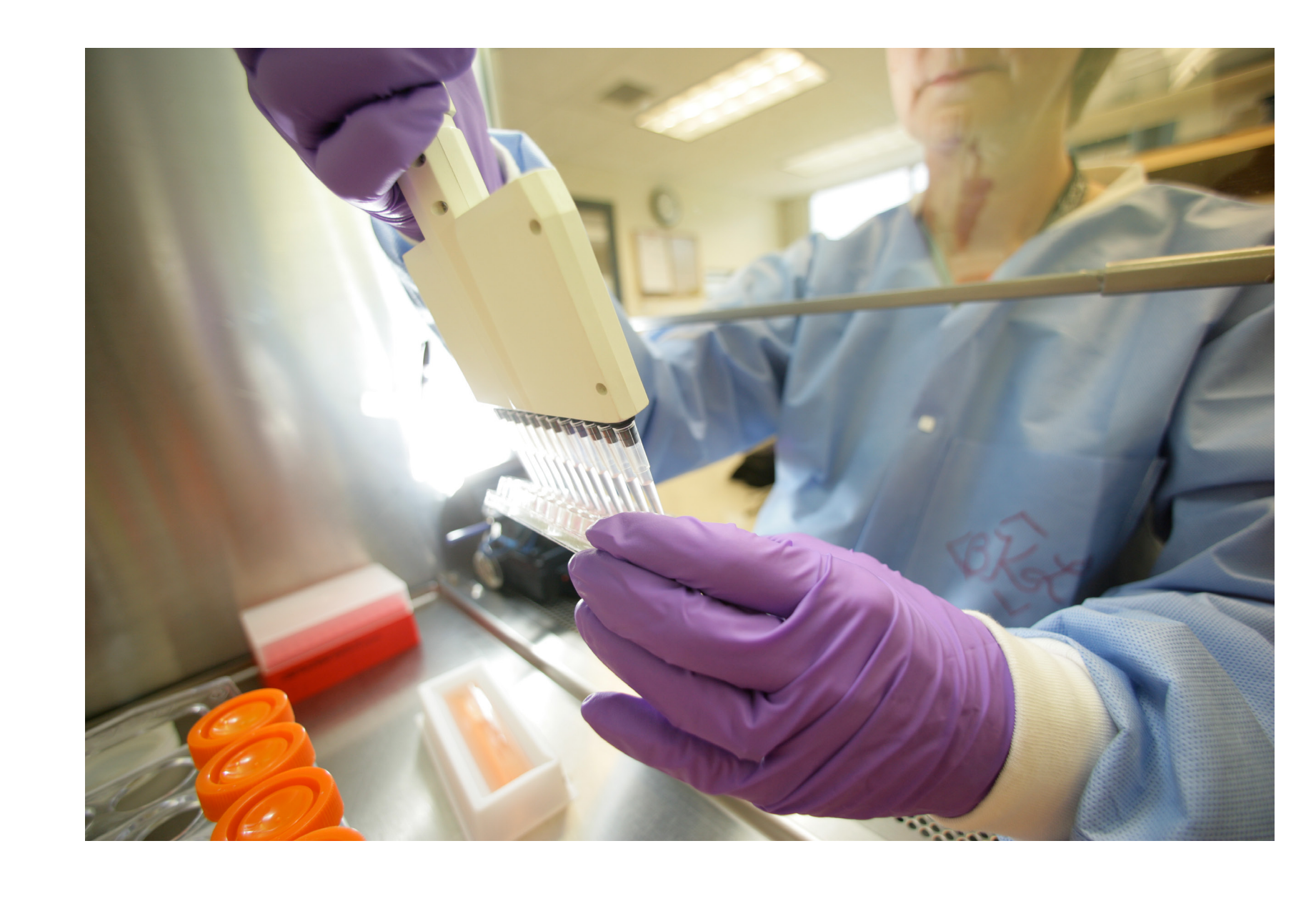
Graduate students and academic staff