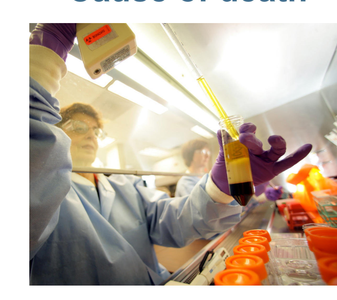
ICD codes—underlying cause (some contributory cancers)