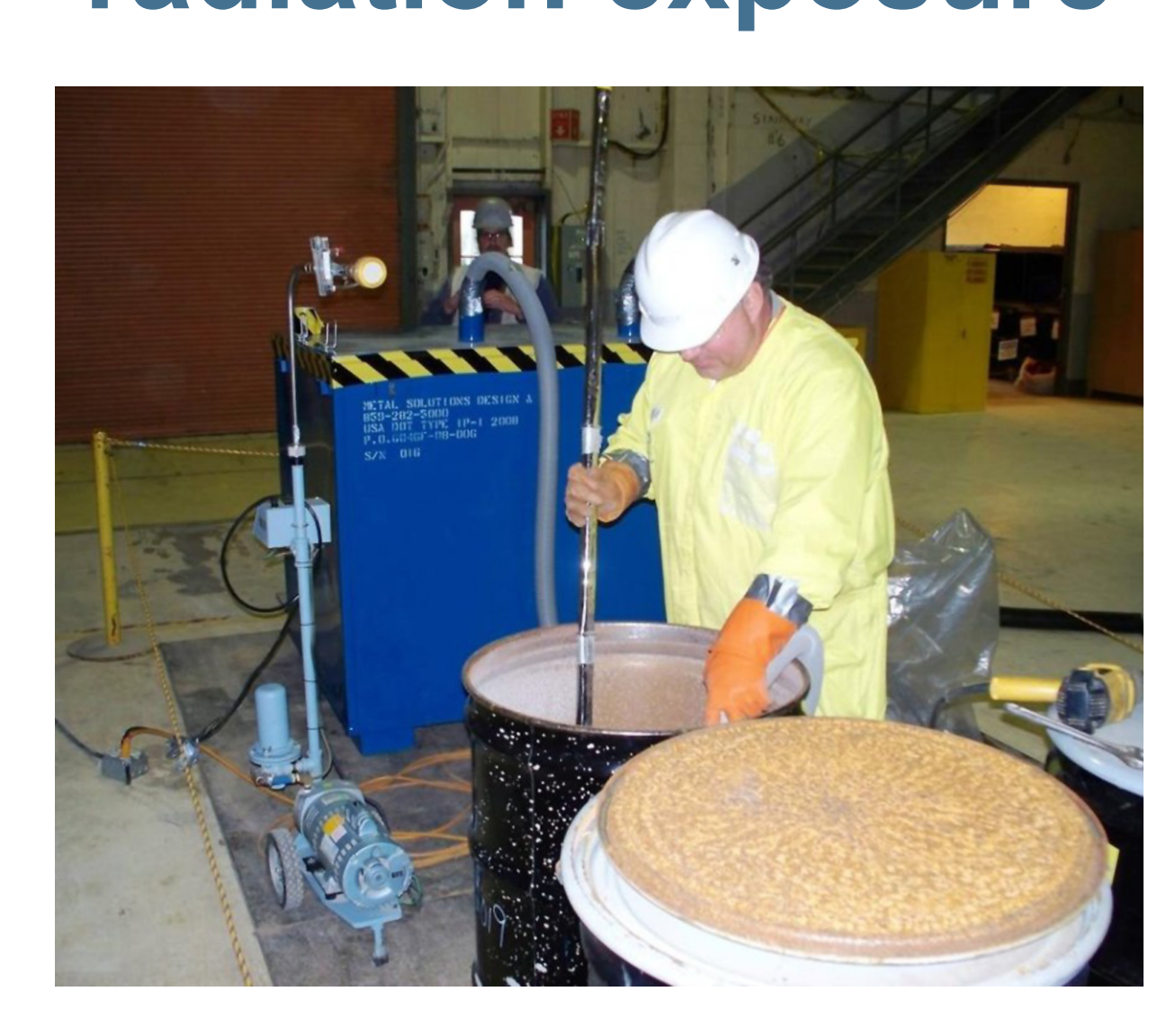
Raw exposure readings and doses used in studies.