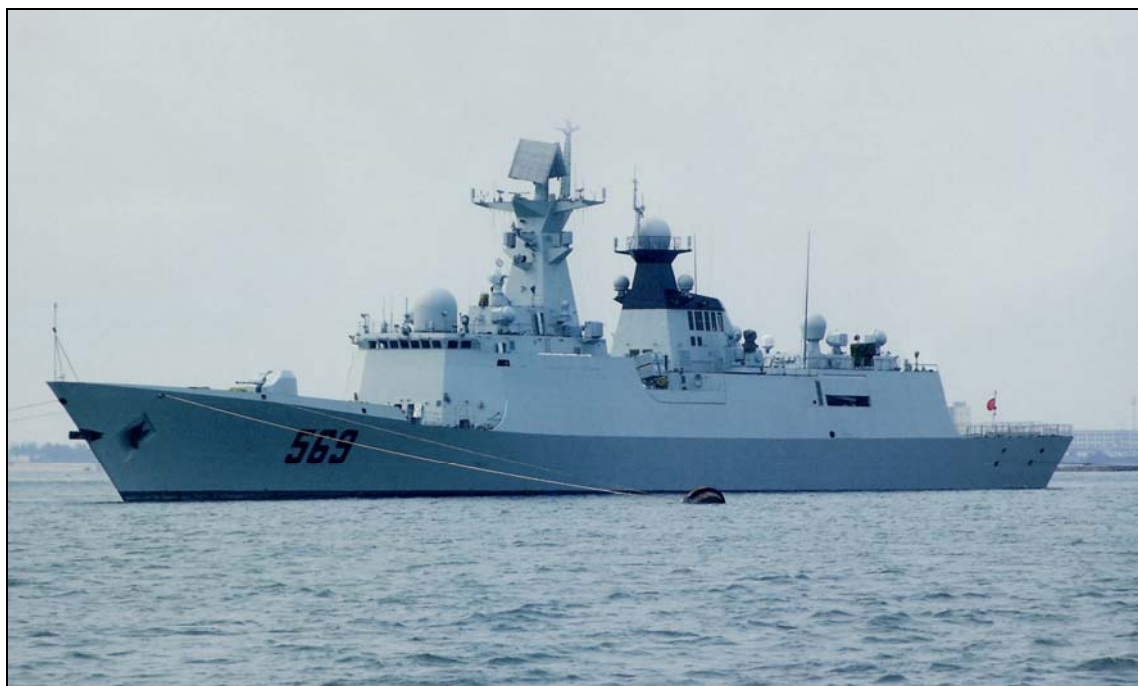
Figure 7. Jiangkai II (Type 054A) Class Frigate