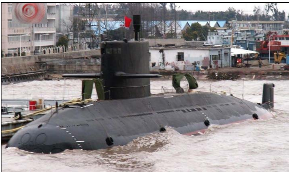
Figure 2. Yuan (Type 041) Class Attack Submarine