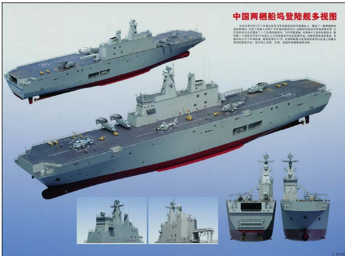
Figure 12. Type 081 LHD (Unconfirmed Conceptual Rendering of a Possible Design)