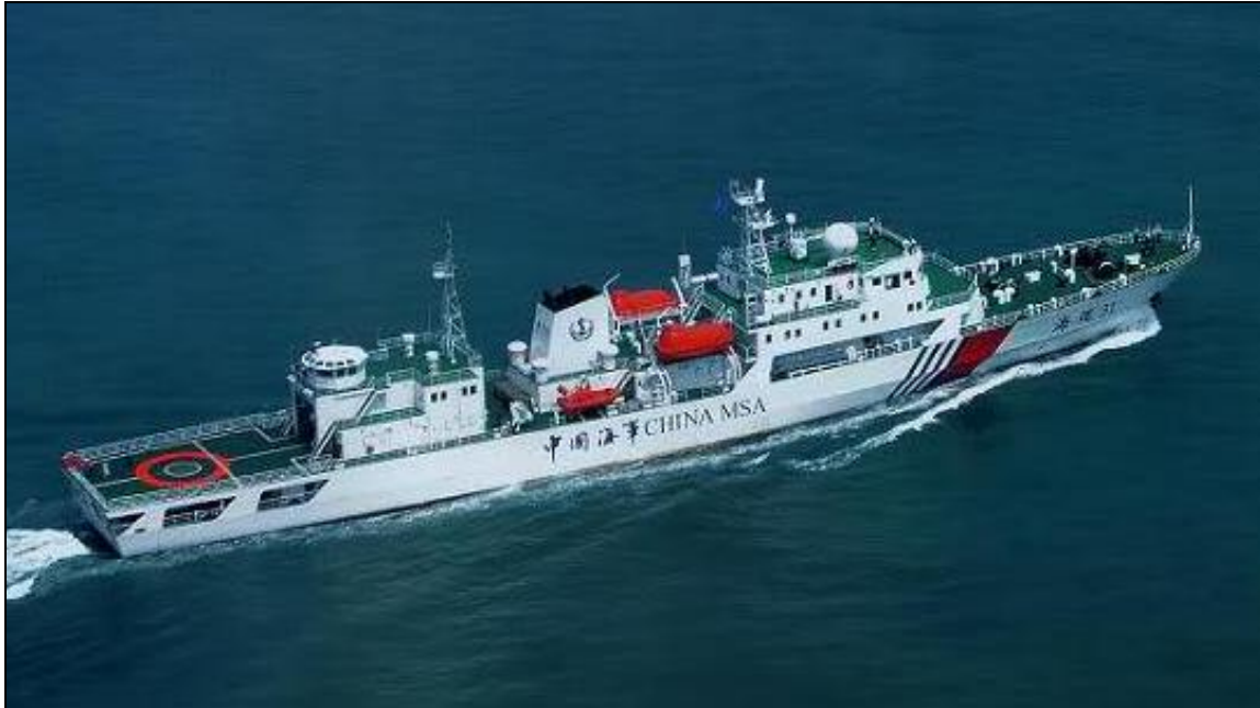
Figure 10. Haixun 01 Maritime Patrol Ship