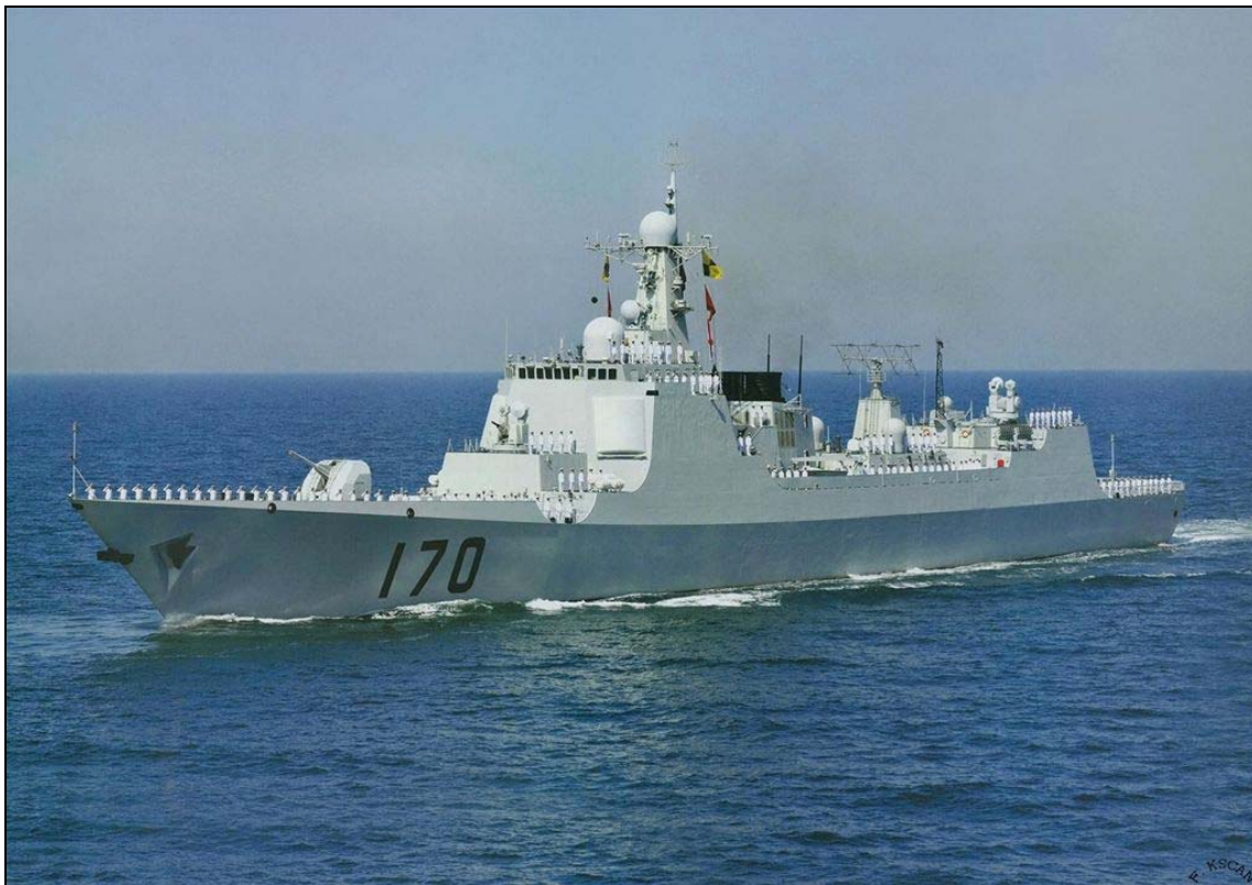
Figure 6. Luyang II (Type 052C) Class Destroyer