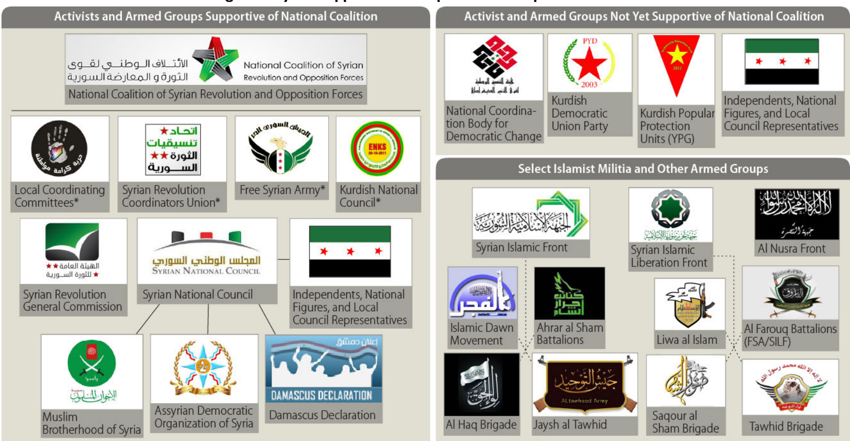
Figure 2. Syrian Opposition Groups: Relationships and Factions

* Many of the groups that supported the creation of the National Coalition of Syrian Revolution and Opposition Forces have diverse memberships of local activists, factions, and brigades. These actors may hold differing views of the National Coalition and its decisions. The Kurdish National Council (KNC) reportedly offered conditional support for the Coalition if several political issues, including Kurdish representation in the Coalition and rights in a future Syria, would be addressed. The KNC was allocated membership in the Coalition, but its support is still being determined. Coalition leaders reportedly have deferred decisions regarding the constitutional issues raised by the KNC until a democratically elected government has been formed.