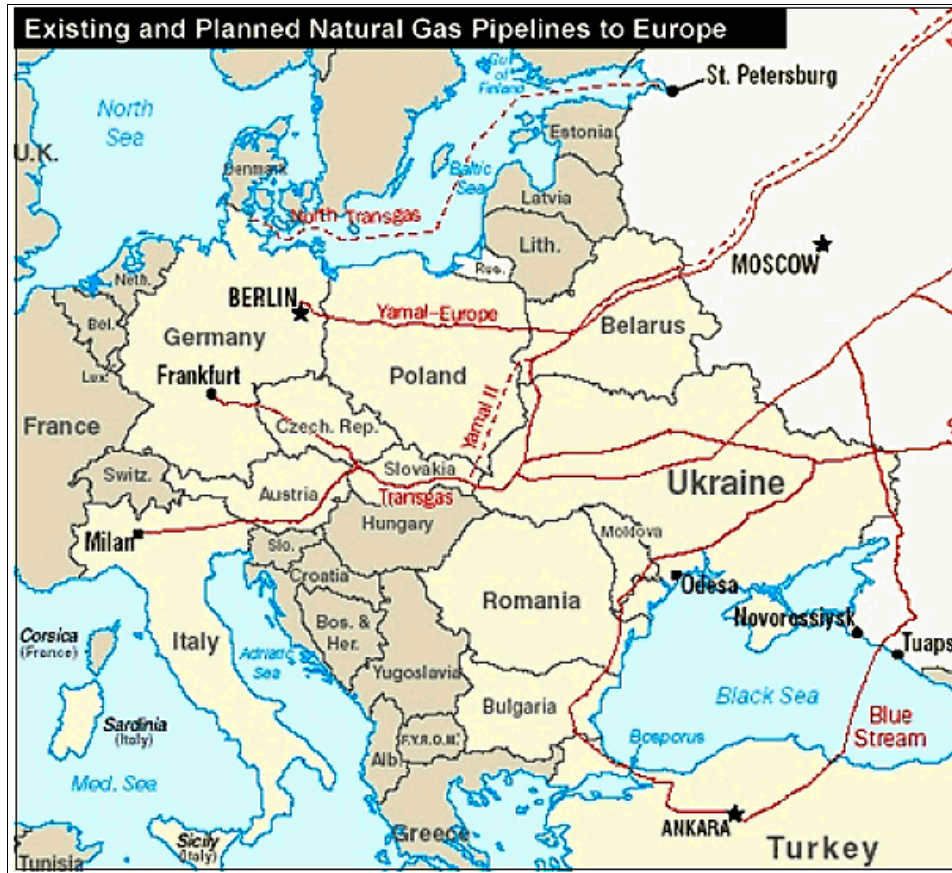
Figure 6. Natural Gas Pipelines to Europe