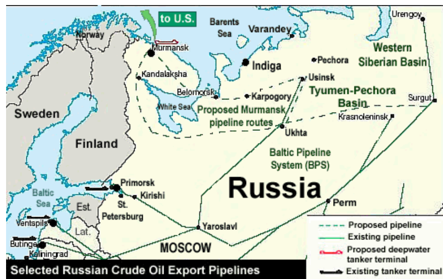
Figure 3. Selected Northwestern Oil Pipelines