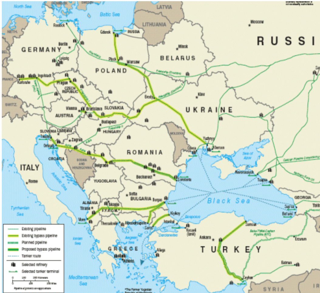
Figure 4. Proposed Bosphorus Bypass Options