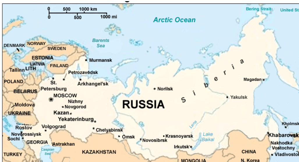
Figure 1. Russia