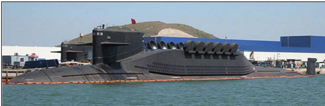
Figure 1. Jin (Type 094) Class Ballistic Missile Submarine