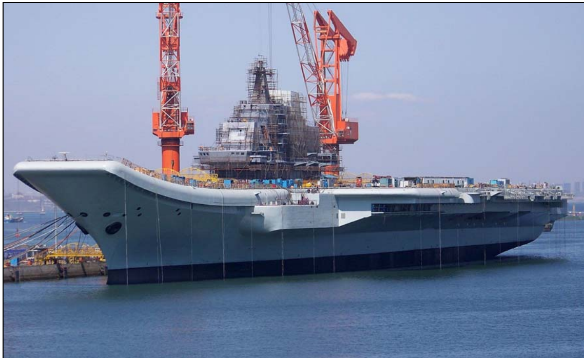
Figure 5. Ex-Ukrainian Carrier Varyag Being Completed at Shipyard in Dalian, China