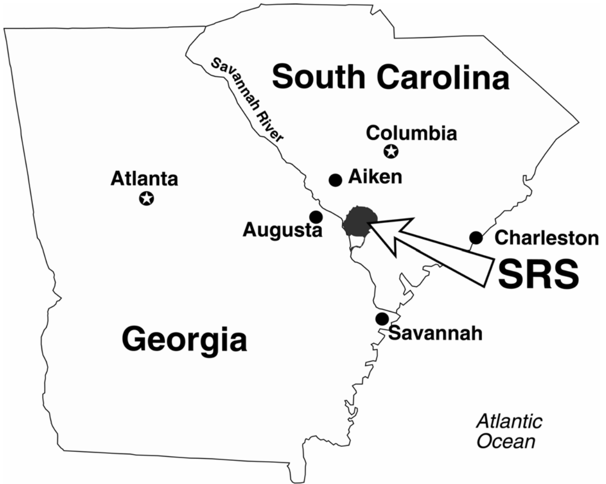
Figure 1.1 – General Location of Savannah River Site