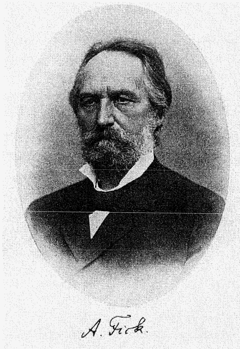
Figure 1: Adolph Fick, pioneer in the application of physics, chemistry, and mathematics to biological systems (Fick, 1903; Frontispiece)

To understand double diffusion across a membrane, Fick considered a single vertical cylindrical pore with hydrophilic walls, separating solutions of differing concentrations above and below. He cited earlier observations of Brücke, and others suggesting that the substance of the partition attracted the particles of water more than the particles of salt. Fick made a clear distinction between two fundamentally different modes of water movement; diffusion of water, and “ filtration of the liquid, by virtue of their cohesion ”, driven by external pressure differences. He assumed the