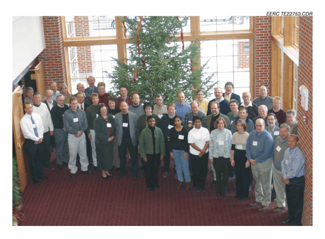
Figure 1. The PCOR Partnership kickoff meeting on December 11 and 12, 2003.

• Attendance at the DOE RCSP Kickoff Meeting in Pittsburgh (November 3, 2003).