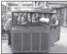
technology integration class