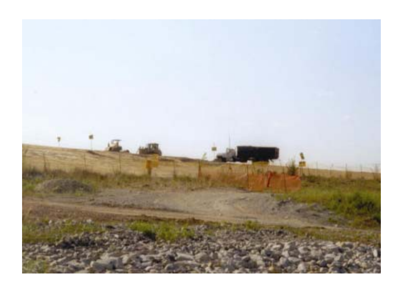
SCFA Technical Assistance Request #143 Fernald, OH August 6-7, 2002

Technologies to Address Leachate from the On-Site Disposal Facility at Fernald Environmental Management Project, Ohio