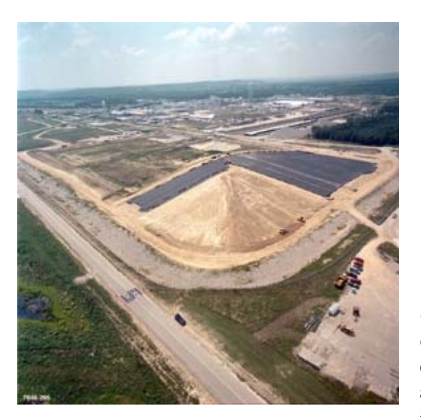
Aerial view of the OSDF.

The On-Site Disposal Facility (OSDF) is located on the eastern side of the Fernald Environmental Management Project (FEMP). Including liner and cover, the OSDF has a depth of 65 feet. It is estimated that approximately 2.5 million cubic yards will be deposited in the facility, 80 percent of which will be impacted soil and 20 percent will be concrete, debris, asbestos, building materials, and various other materials. Within the cells, waste is organized into alternating lifts of soil and debris, with horizontal segregation of the debris according to type (i.e., grouping asbestos material together). Below the cover system and waste mass in each cell, there is a multi-layer liner system, a