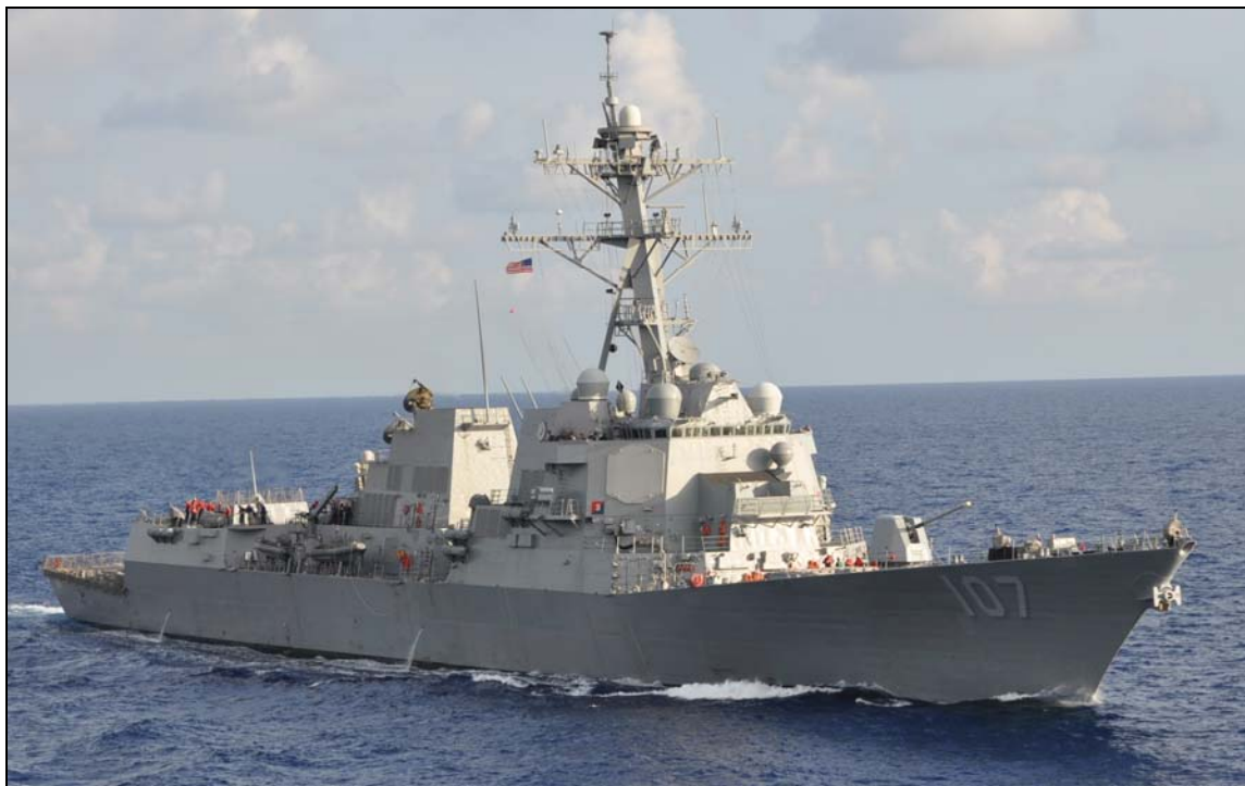
Figure I. DDG-51 Class Destroyer