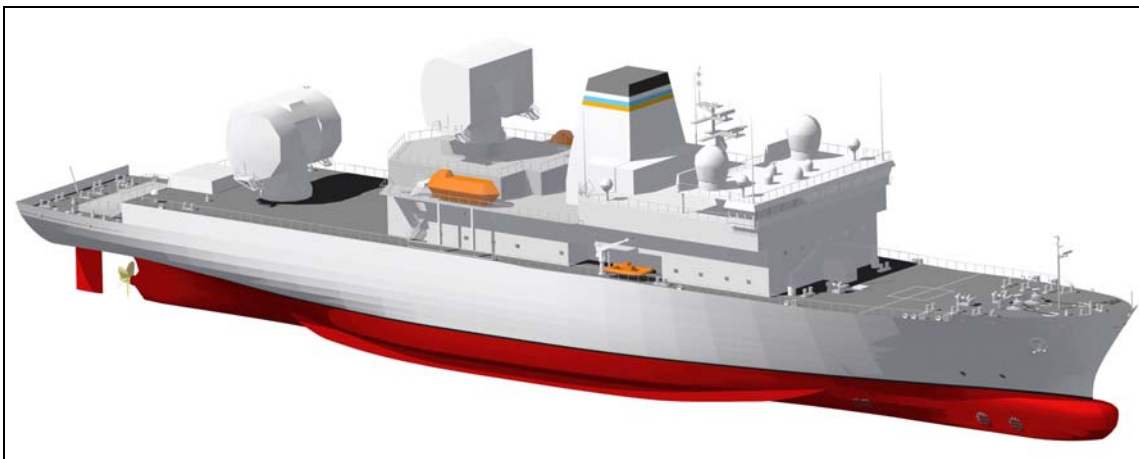
Figure 3. Cobra Judy Replacement Ship