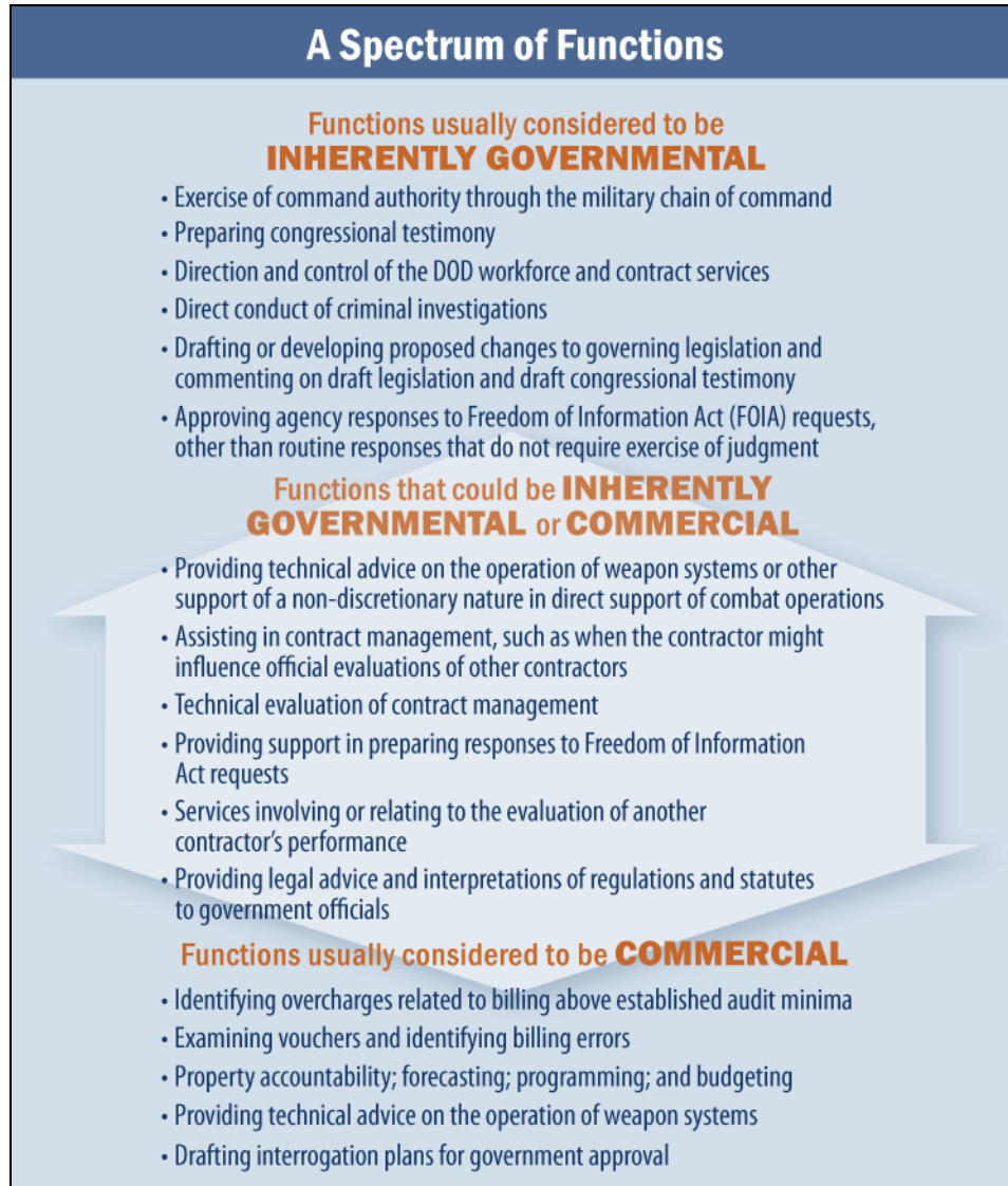
Figure I. Categorization of Functions as Inherently Governmental or Commercial

protection of resources ... in uncontrolled or unpredictable high-threat environments should ordinarily be performed by members of the Armed Forces.” 187