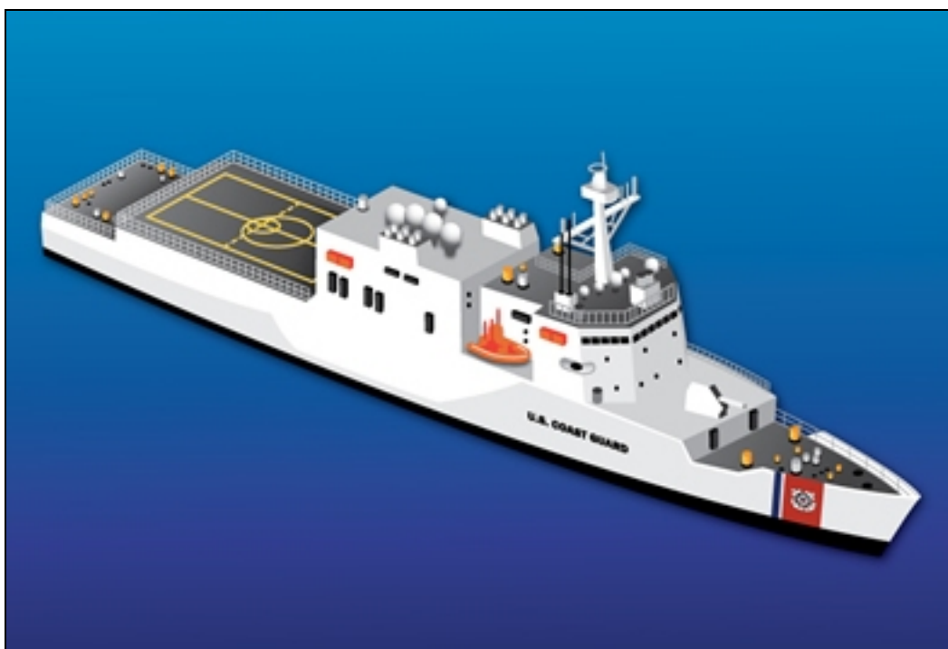
Figure 2. Offshore Patrol Cutter (Generic Conceptual Rendering)