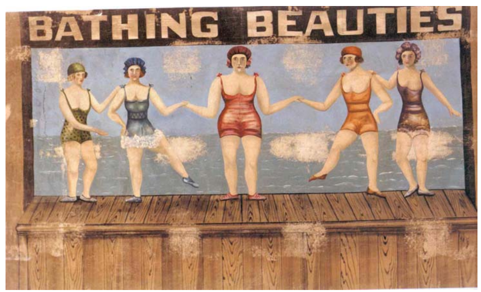
Fig 2 (7'6"x12')