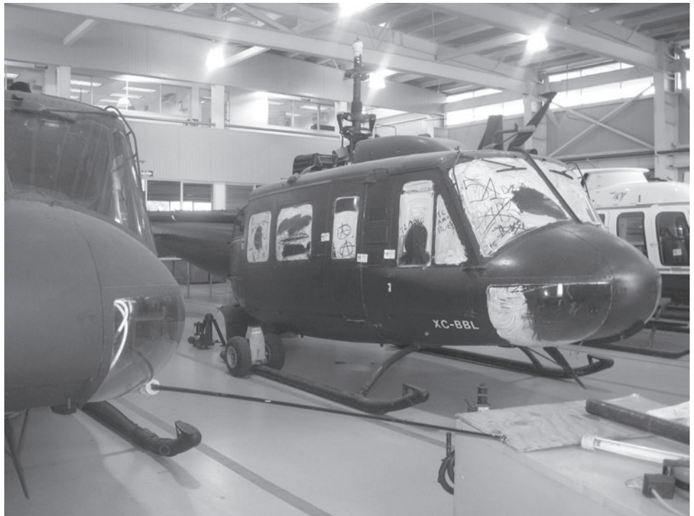
Figure 3: Mexican UH-1H Helicopter