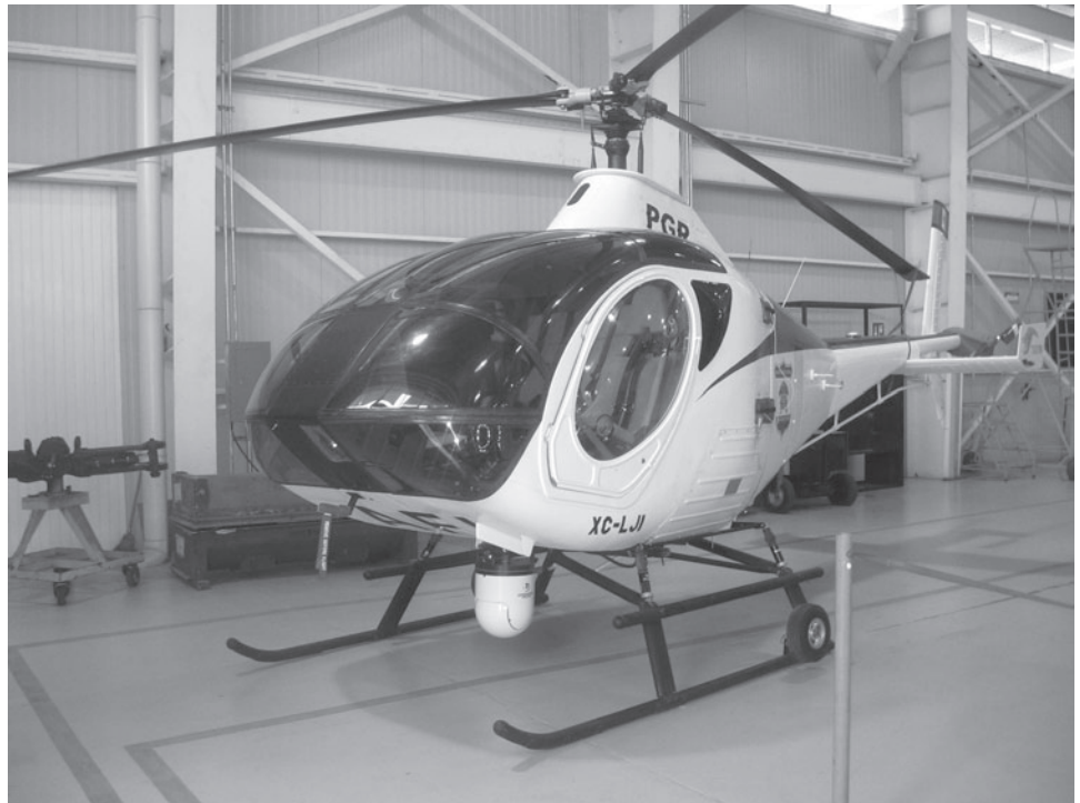
Figure 4: Mexican Schweizer 333 Helicopter