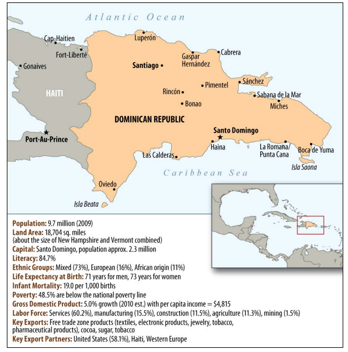
Figure I. Map of the Dominican Republic and Haiti