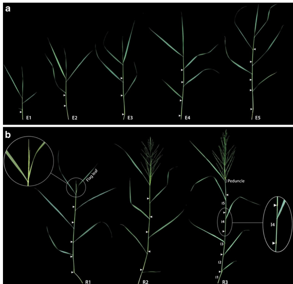
Fig. 1 Developmental stages of switchgrass. Various elongation ( E ) (a) and reproductive ( R ) stages (b) of switchgrass tillers were collected and photographed. Arrowheads indicate visible and/or palpable nodes. Internodes 1–5 (I1–I5) and the peduncle are labeled on the R3 tiller

50-mL volumetric flask containing 10 mL of 2 M NaOH and 12 mL of acetic acid. Hydroxylamine (1 mL of 0.5 M) was added to each flask, and samples were diluted to 50 mL with acetic acid. Absorption spectra (250 to 350 nm) were determined for each sample and used to determine the absorption maxima at 280 nm. A molar extinction coefficient of 17.2 was used for all samples [21].