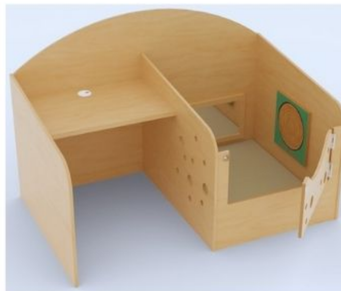
Family Workstation, TMC Furniture Inc.

In December 2023, I conducted research on public and academic libraries that have family initiatives. According to my data, many academic and public libraries are supporting families by providing dedicated spaces, amenities, services, and events.