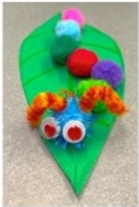
Craft for 3/19

We planned each family study date, craft, activity, story time, and set up each event accordingly. Planning Family Study Hours as a whole included coordinating with Denton ISD Early Release days, planning activities to relate to chosen dates, promotion, craft research and trial runs, story time planning, and costs breakdowns.