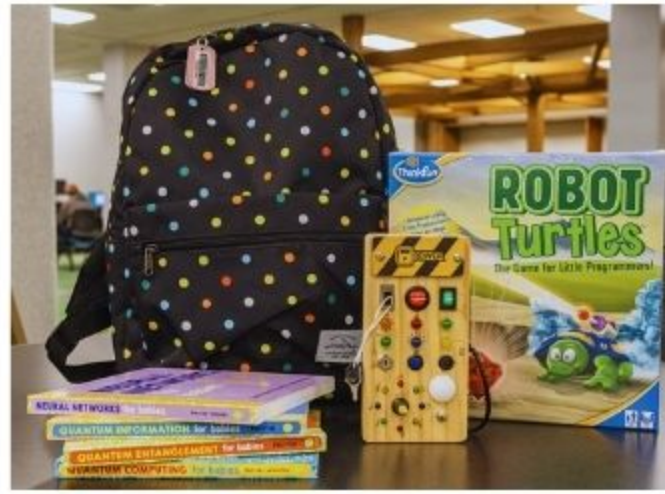
Science Kids Activity Kit, Ages 4-9