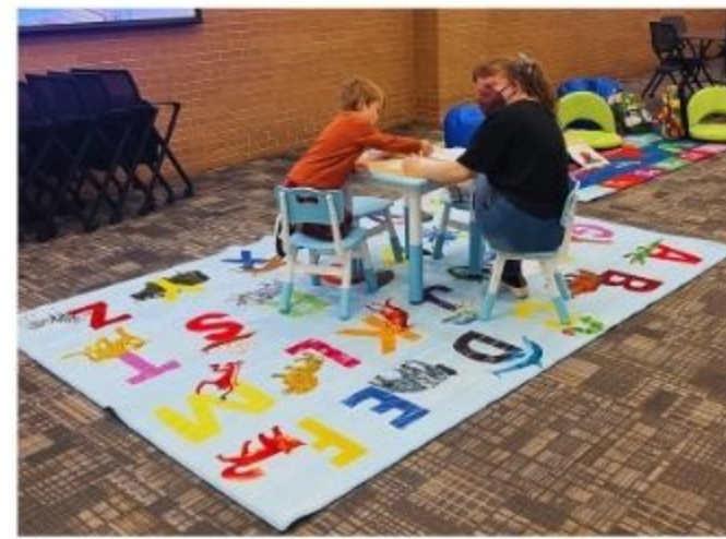
Family Study Hours