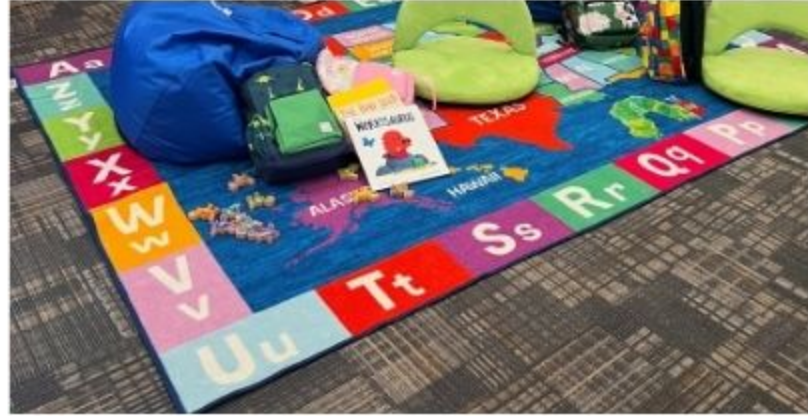
Family Study Hours