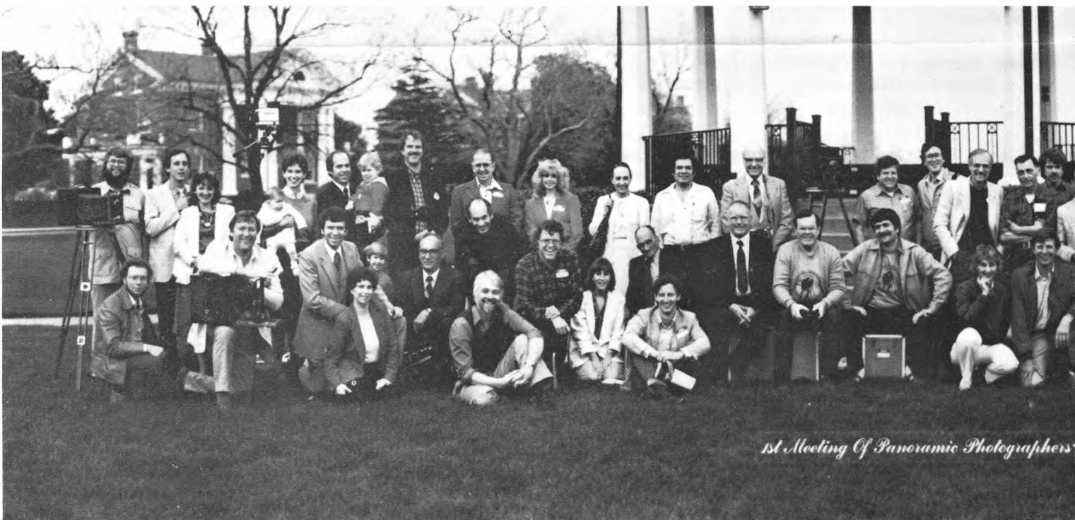
1st Meeting Of Panoramic Photographers