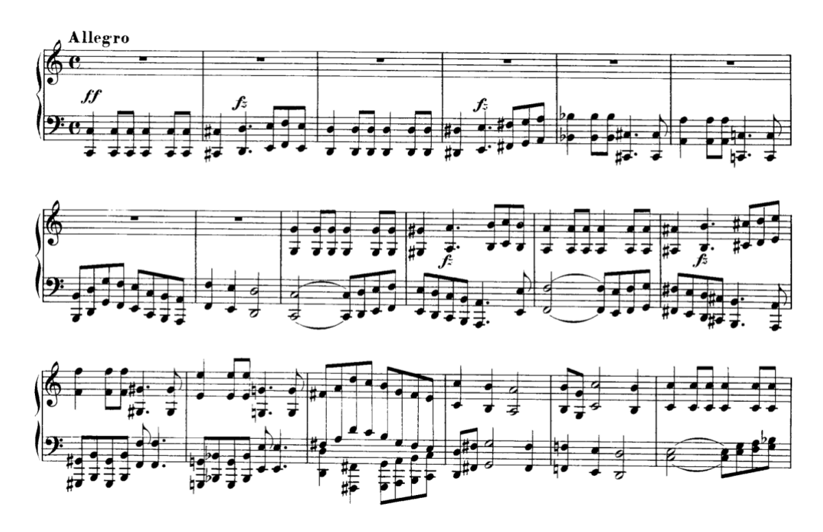
Musical Example 21: Schubert, Wanderer Fantasy in C major D. 760, mm. 1–18

The lack of dynamics in the second movement is quite unconventional for the nineteenth century, suggesting once again that Nepomuceno is being guided by baroque sensibilities, as compositions written in the Baroque period are often seen without dynamic markings.