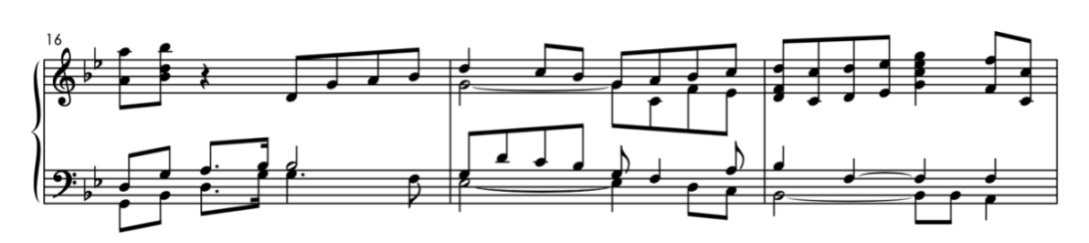
Musical Example 7: Second movement, mm. 16–21

The transition to secondary space is fairly smooth and subtle. The music flows to G minor as the melody begins to accelerate. Instead of steady and slow quarter notes, Nepomuceno adds many eighth notes that shape the music more dramatically. The secondary space has ten measures, which can be equally divided into two parts. The first five measures state the new theme in G minor, whereas the second half modulates to D minor (Musical Example 7):