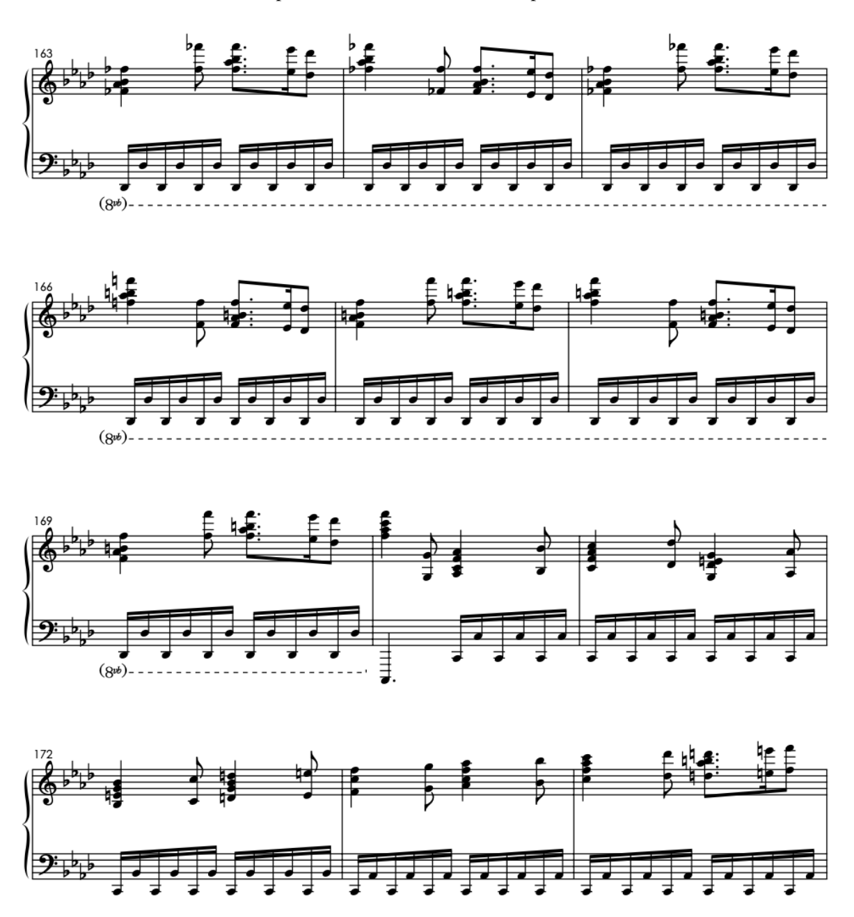
Musical Example 16: First movement, development, mm. 163–174

Organ effects can also be found in the second and third movements, with both the melody and accompaniment being presented in octaves. The coda of the second movement features a long pedal point on B-flat, held for seven measures. At the end of the third movement, the music