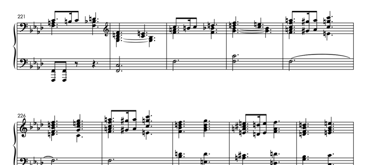
The Organ Topic

Musical Example 15: First movement, secondary theme of recapitulation, mm. 221–230