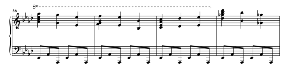
Musical Example 3: First movement, mm. 66–69

It is notable that Nepomuceno carefully follows the classical tradition of placing a repeat sign at the end of the exposition.