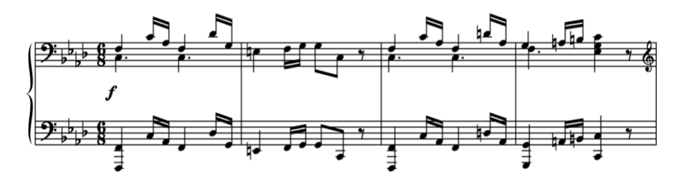
Musical Example 19: J. S. Bach, fugue in F minor, BWV 881, mm. 1-3