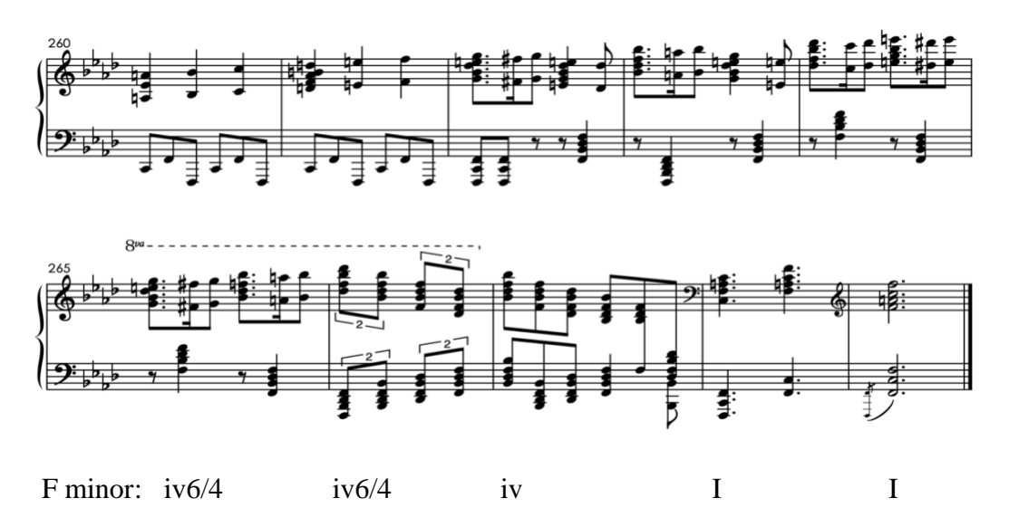
Musical Example 22: First movement, mm. 260-269

Moreover, the C section in the rondo movement is set in a light chorale style (Musical Example 23):