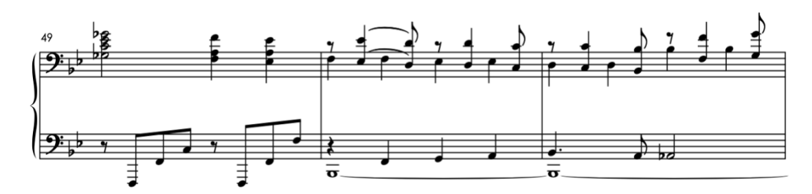
Musical Example 9: Second movement, mm. 49-60

The coda starts at m. 50, mixing themes from primary and secondary spaces. It begins with the melodic material from the opening theme but in its parallel minor key. Additionally, it is now set on offbeats, above a B-flat pedal tone. The ending of the coda is drawn from the secondary space, and the whole movement evaporates in an ascending line and ends in the minor mode (Musical Example 9):