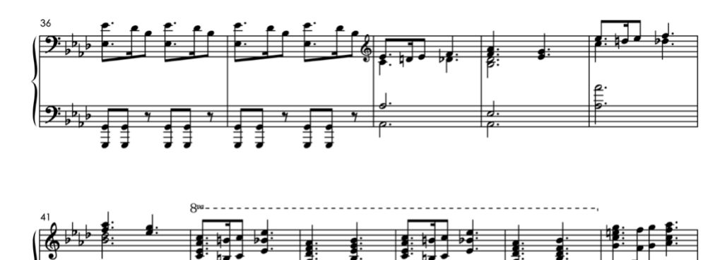
Musical Example 2: First movement, mm. 36-46

The closing space starts with accompanying octave ostinati driving up to the end of the exposition. It also adopts a mixture of triple and duple meters between hands (Musical Example 3):