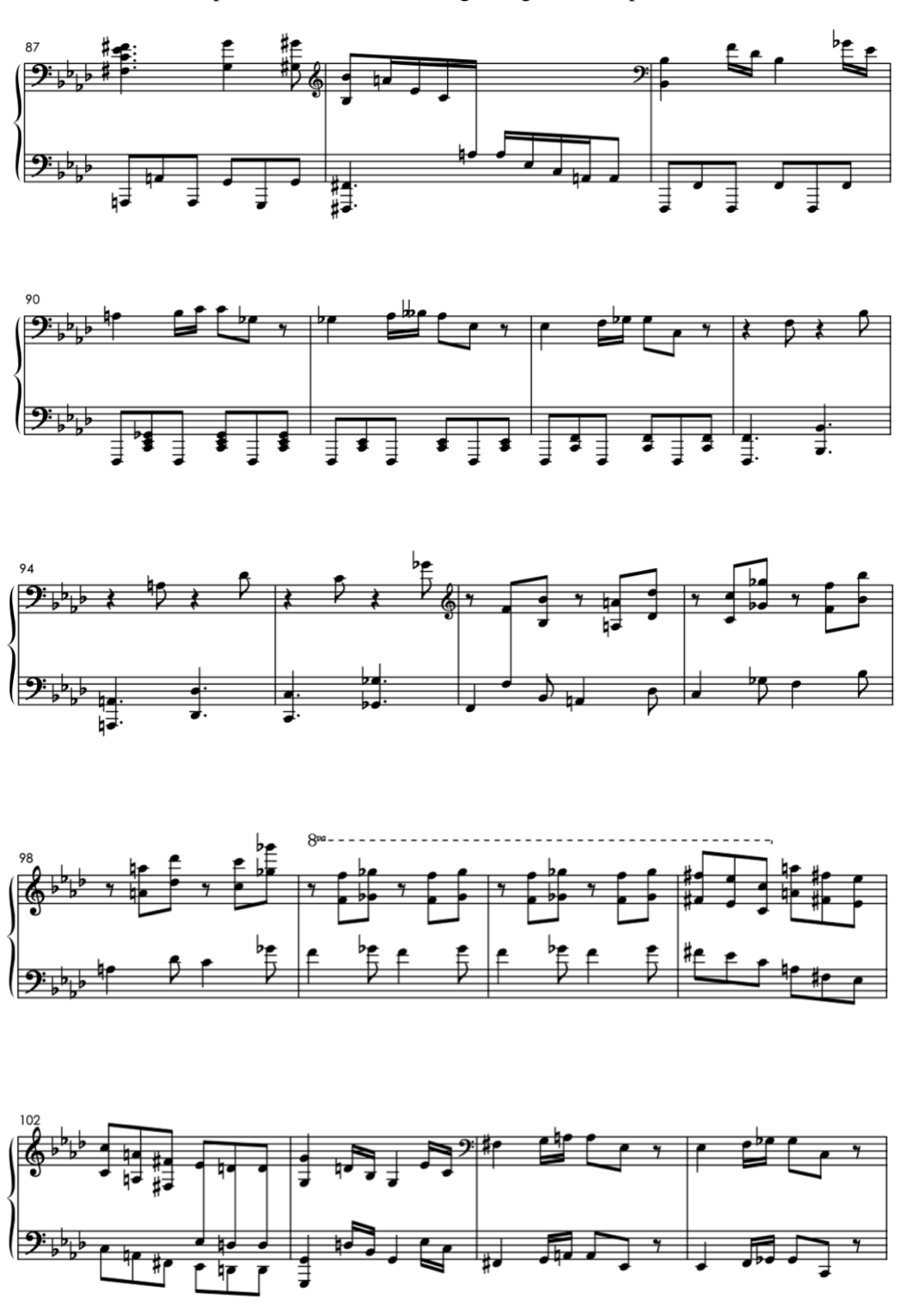
Musical Example 4: First movement, beginning of development, mm. 87–108