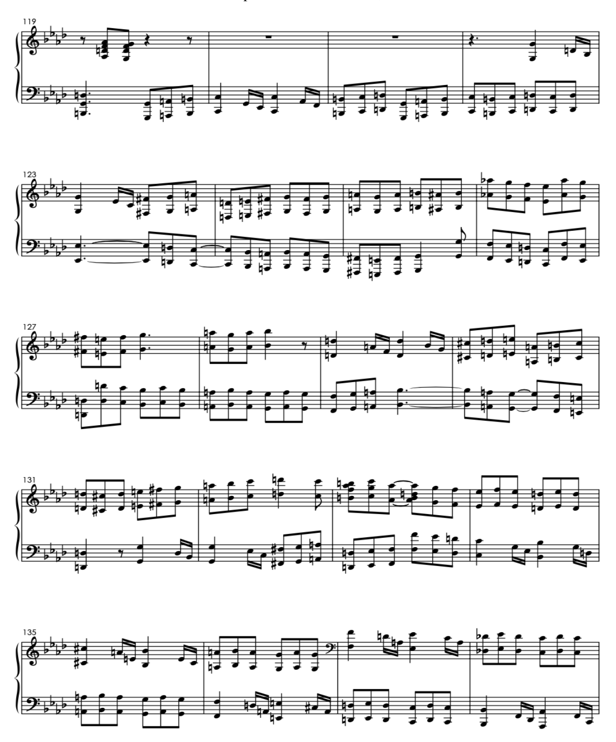
Musical Example 20: First movement, mm. 120–138

In mm. 120–162, the composer alternates the subject entrances between hands, expanding the music into a sequential and virtuosic passage. The use of bold, fugal octaves is quite