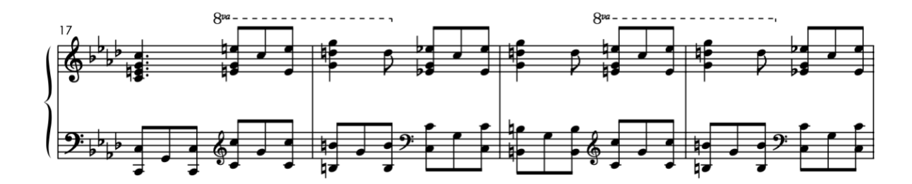
Musical Example 11: Third movement, mm. 17-20

The manner of writing in mm. 22–23 bears a striking resemblance to the first movement's transitional space. The bass notes move up by step while the right hand alternates between octaves and single eighth notes (Musical Example 12):