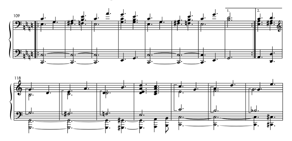
Musical Example 14: Third movement, mm. 109-114

The refrain returns at m. 82, leading to the C section in C major at m. 109. It is again set in choral four-part writing, with constant dotted-quarter notes and leaps in the soprano line. It shares many qualities with the B section, though it is longer (Musical Example 14):