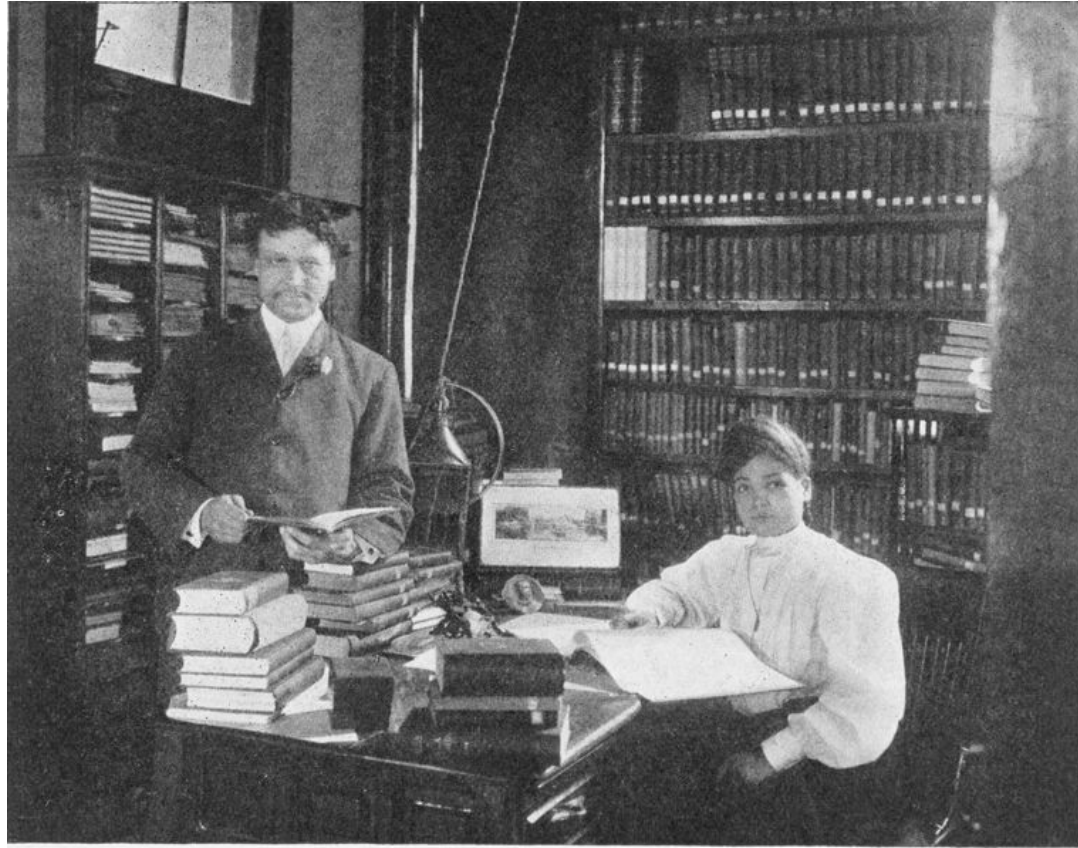
336. THE LIBRARIAN AT TUSKEGEE AND HIS ASSISTANT