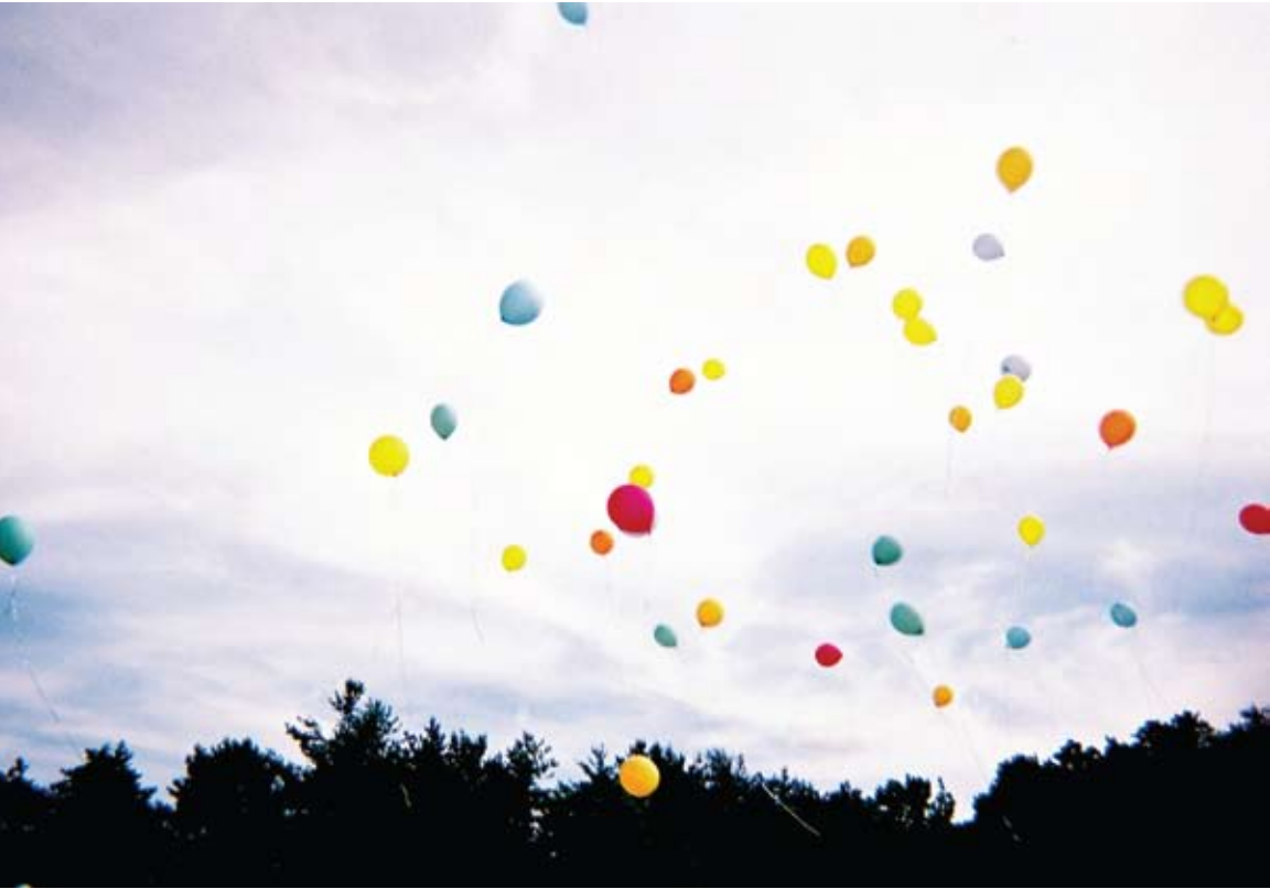
Susan Blick · Red Balloons