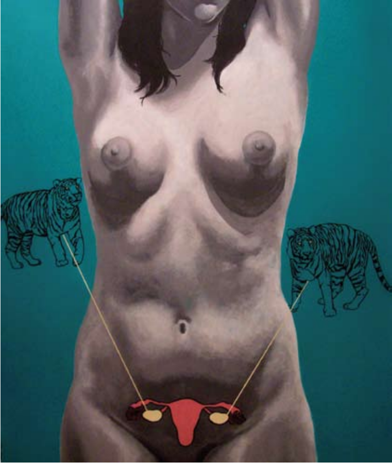
Erin Page · Fierce Like Me