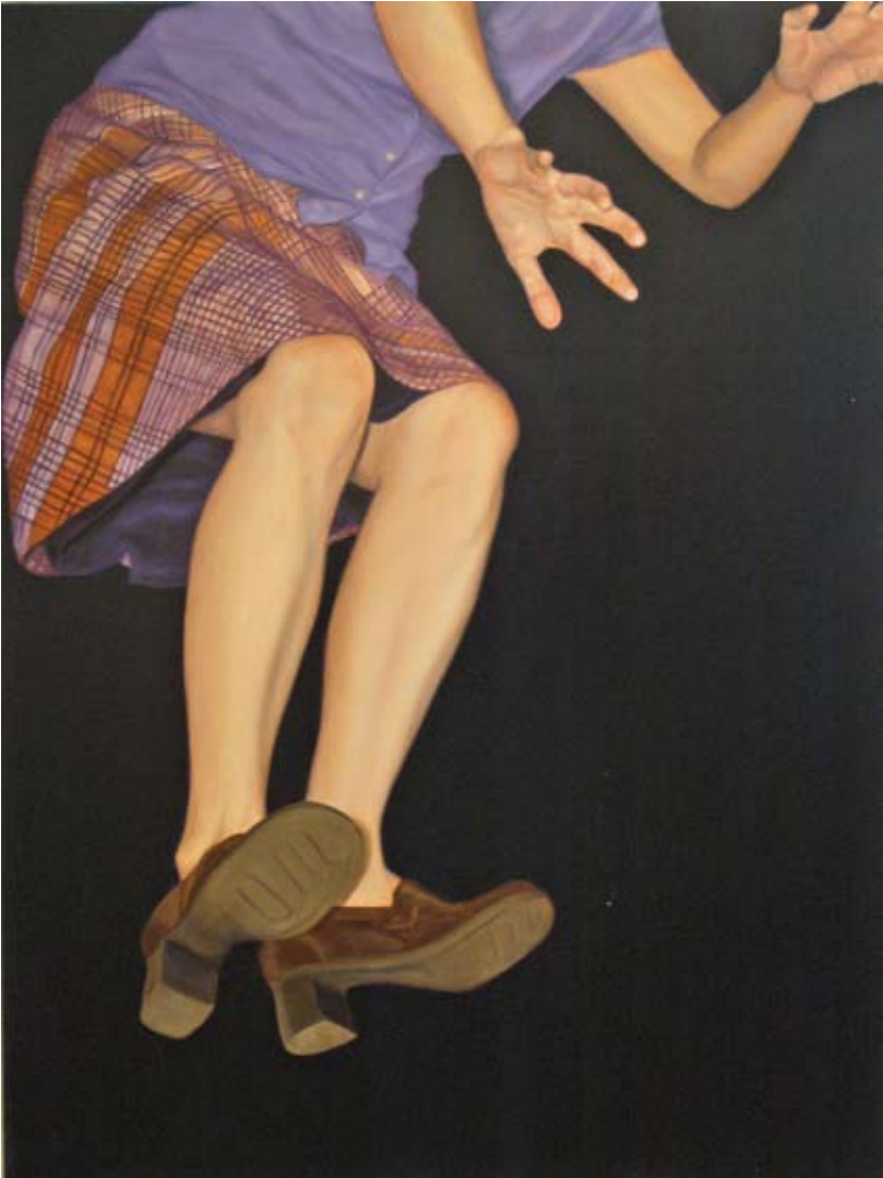
Lori Giesler · ITYP 6