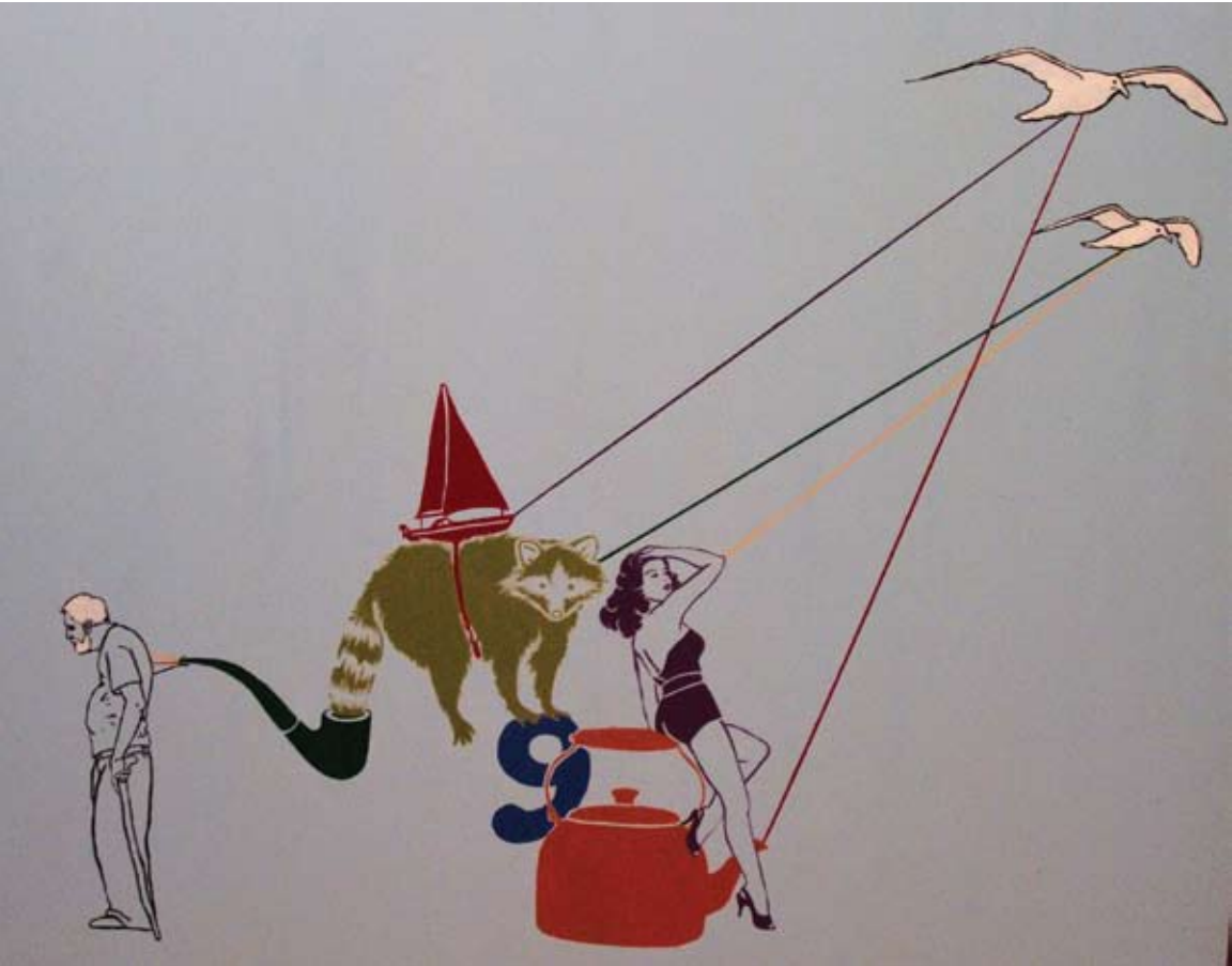
Erin Page · In Memory