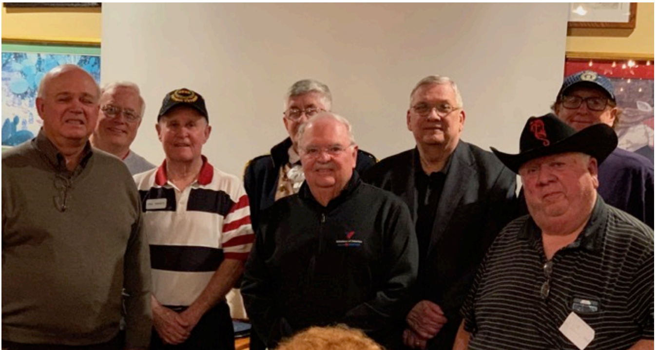
The Congressional Viet Nam Commemoration Lapel Pin Authorized By Congress