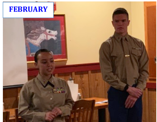
McKinney High School Marine Corp Junior ROTC – JROTC Program Overview