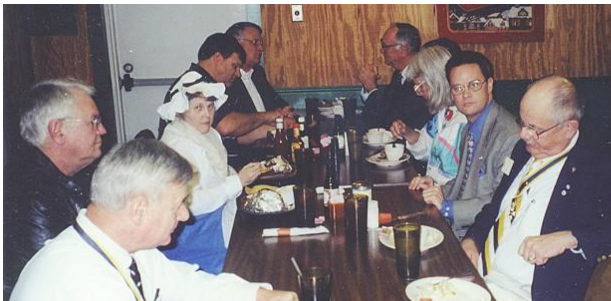
Members talking before dinner.