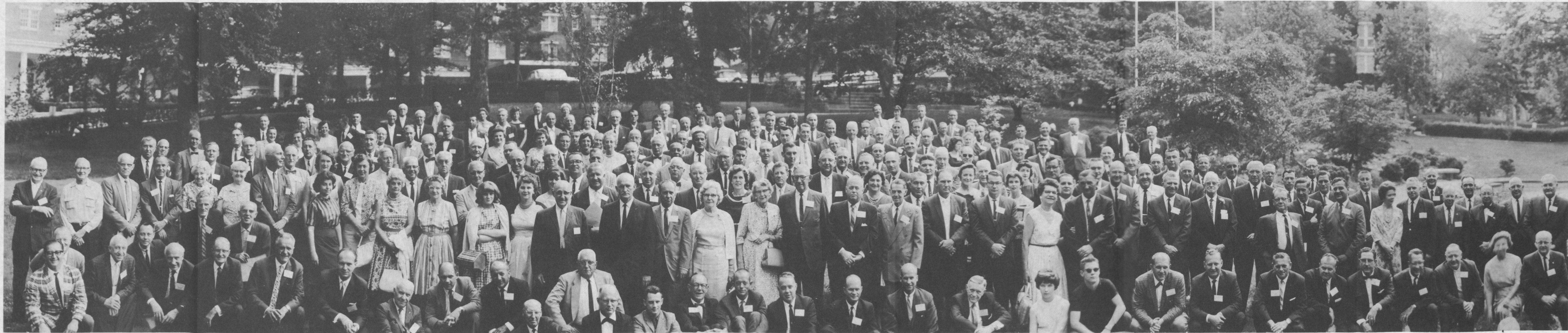
Forty-eighth National Conference on Weights and Measures, Sheraton-Park Hotel, Washington, D.C., June 10-14, 1963, Sponsored by U.S. Department of Commerce