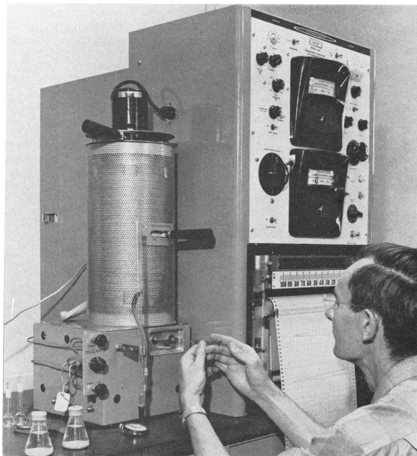
FIGURE 1.—A small amount of an alcohol-water extract from grain is injected into a gas chromatograph. The relative amounts of water and alcohol are recorded as separate peaks on a chart.

The new method, excluding extraction time, takes about one-half hour. For this reason, and also because of the kind of equipment involved, it is not a field method, but rather is suitable as a labora-