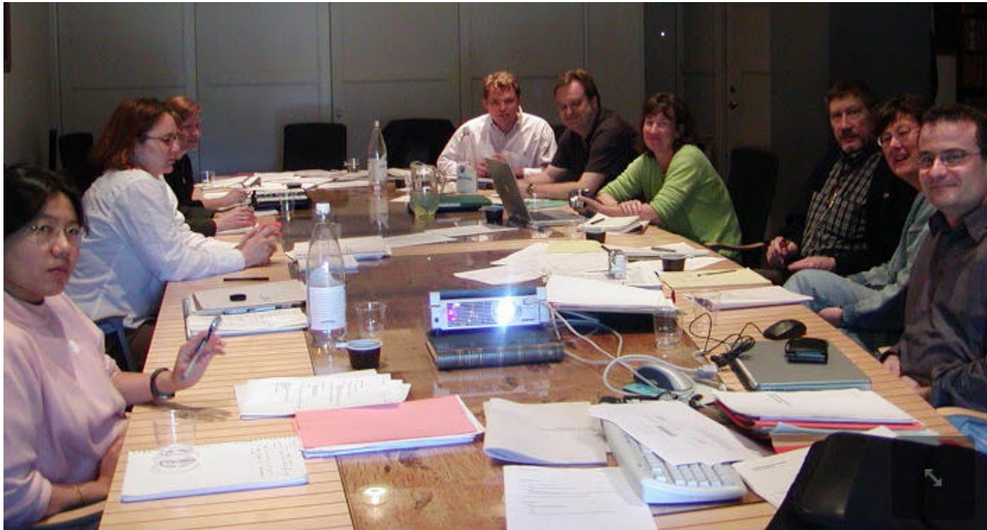
Heritrix Working Group meeting, Stockholm, June 2003