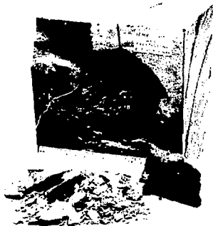
Fig. 1. Stress wave propagation. Fig. 2. Example one-shot spall.