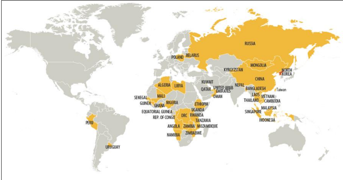
Figure 3. Countries with DPRK Workers in 2018