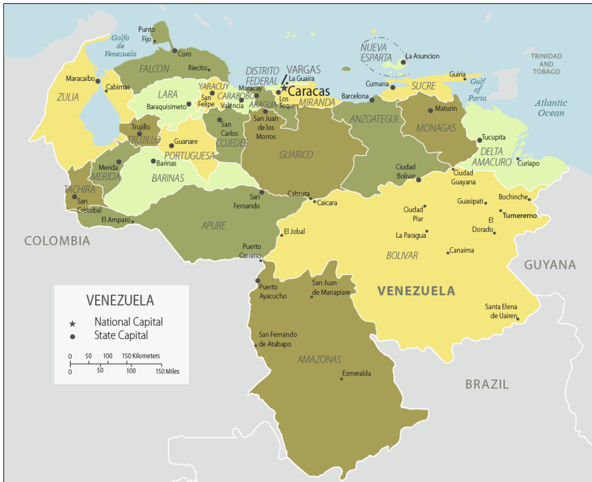
Figure I. Political Map of Venezuela