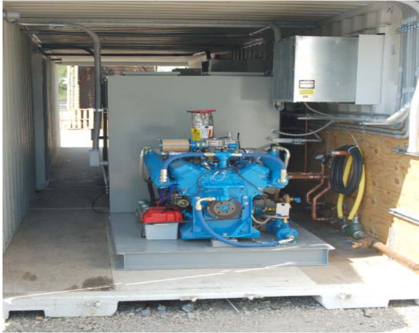
Figure 3. Tecogen Prime Mover with Inverter