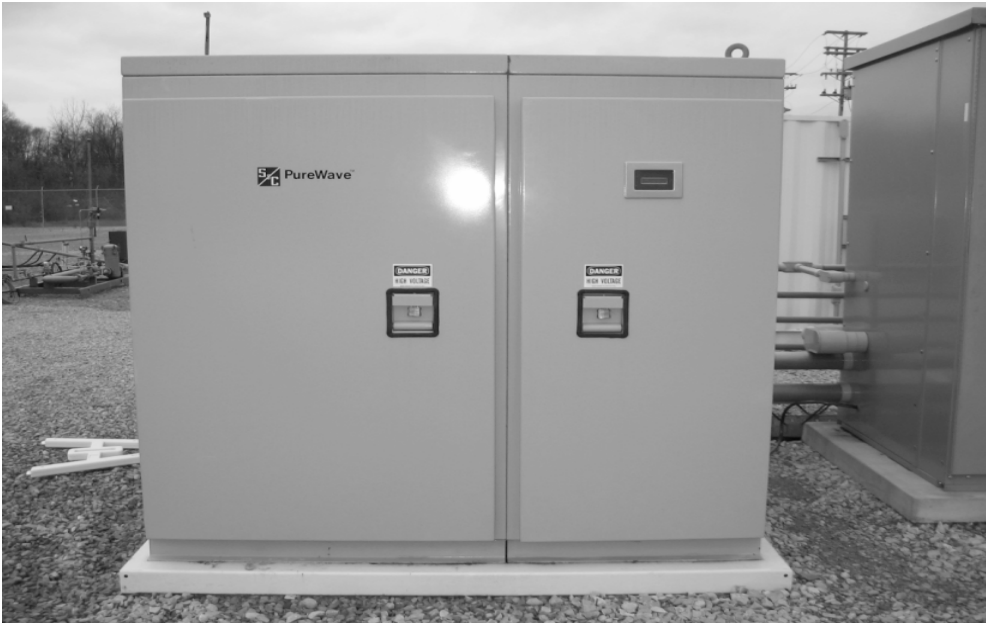
Figure 4. The Static Switch