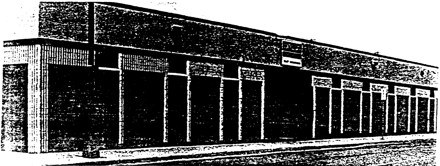
For more than a decade, the Control Data Corporation's Selby Bindery has provided several hundred high-quality jobs for inner-city residents of St. Paul, Minnesota and has operated as a profitable private enterprise as well.