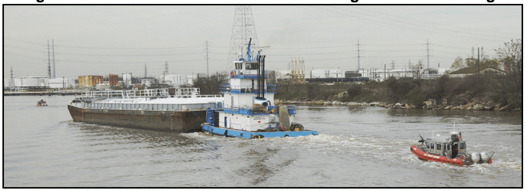
Figure 6: Coast Guard Patrol Boats Escorting a Chemicals Barge