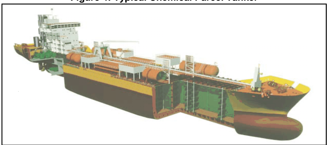
Figure 4: Typical Chemical Parcel Tanker

Chemical parcel tankers are versatile vessels designed to carry a wide range of liquid and chemical cargoes, including EPA/RMP hazardous chemicals. Externally, they appear similar to petroleum product tankers, but typically can carry 10 to 60 separate cargo tanks to simultaneously accommodate multiple cargoes or "parcels." They range in total cargo capacity from approximately 3,000 to 50,000 tons, although most are well under 50,000 tons. Figure 4 is an illustration of a chemical parcel tanker with a cutaway view showing individual cargo tanks.