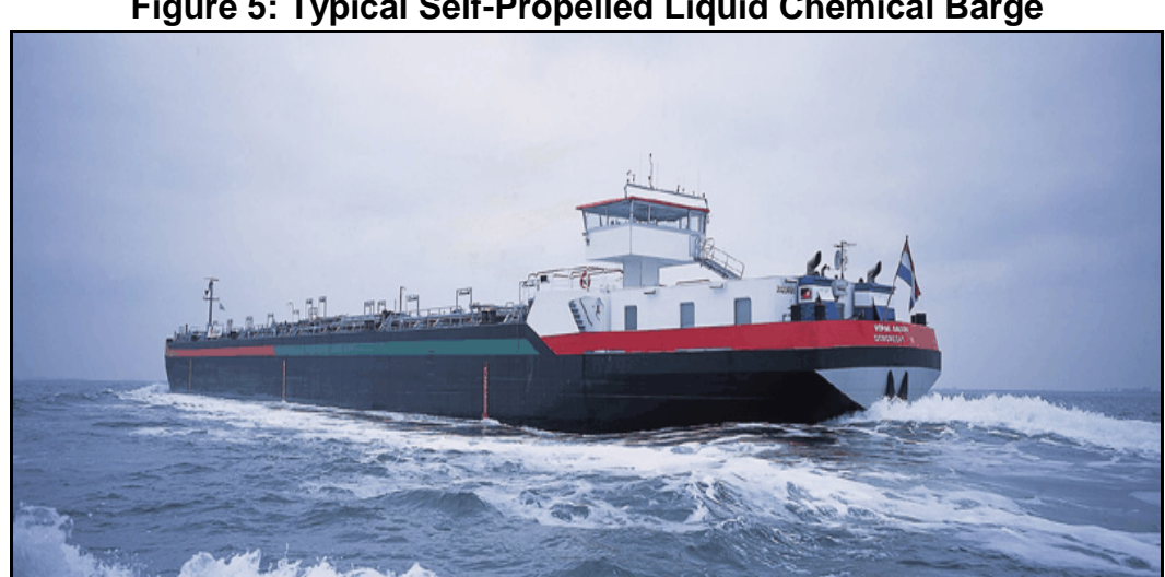
Figure 5: Typical Self-Propelled Liquid Chemical Barge

Liquid chemical barges are shallow draft vessels designed to carry bulk liquid chemicals, primarily in coastal regions and through inland waterways. Liquid chemical barges are similar to parcel tankers in that they may contain multiple separate cargo tanks lined with stainless steel or other special coatings. Such barges range in size from 700 tons to 3,500 tons of total cargo capacity.<sup>41</sup> Larger barges transporting hazardous chemicals are typically double-hulled and self-propelled ( Figure 5 ), although smaller chemical barges may be unpowered, relying upon tugboats or towboats for movement. Unpowered chemical barges on inland waterways are approximately 52 to 54 feet wide and up to 300 feet long.<sup>42</sup> Inland barges usually travel river systems in groups of two to eight barges per towboat, although "linehaul" tows may consist of more than 20 barges, picking up and dropping off barges at various points along a given route.<sup>43</sup> Such inland barges may be refrigerated, employing two insulated cargo tanks, each approximately 18 feet in diameter and up to 240 feet long, and each capable of carrying 1,250 to 1,500 tons of ammonia, propylene, or other refrigerated chemical product. 44 Pressurized cargo tanks are also available for pressurized liquid cargoes.