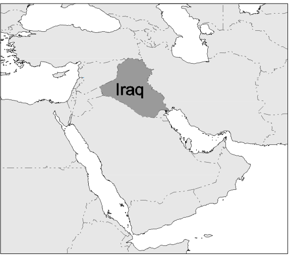
Figure 1. Iraq in the Middle East

Background. Bush Administration concerns about Iraq's alleged weapons of mass destruction programs intensified after September 11, 2001 terrorist attacks. President Bush named Iraq, Iran, and North Korea as the "axis of evil" nations in his January 2002 State of the Union address. Vice President Cheney, in two August 2002 speeches, accused Iraqi leader Saddam Hussein of seeking weapons of mass destruction to dominate the Middle East and threaten U.S. oil These speeches fueled supplies.1 speculation that the United States Source: Map Resources. Adapted by CRS. might act unilaterally against Iraq. However, in a September 12, 2002