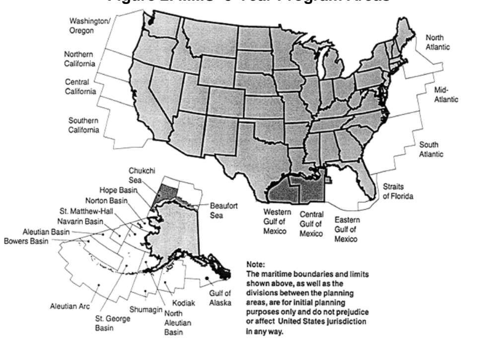
Figure 2. MMS 5-Year Program Areas

During the summer of 2005, the MMS introduced its proposed five-year leasing program for 2007-2012. Public hearings on the leasing program have been held, and states and interest groups are filing comments on future lease sale areas for the 2007-2012 leasing program.<sup>5</sup> On April 30, 2007, the Secretary of the Interior announced its Proposed Final Program. Areas along the Atlantic coast (i.e., Virginia, currently covered by OCS moratoria), the North Aleutian Basin (Alaska), and the central GOM are included in the final leasing program. A small area would be offered for lease in the eastern GOM planning area, which has been redrawn to provide for more accuracy in boundaries between states and planning areas.<sup>6</sup> The new five-year leasing program began July 1, 2007.