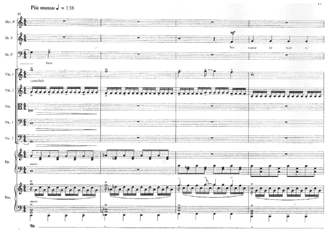
Example 4.1. The Man Who Mistook His Wife For a Hat, mm. 88-91

[S] Reproduced with permission from Schirmer Music.