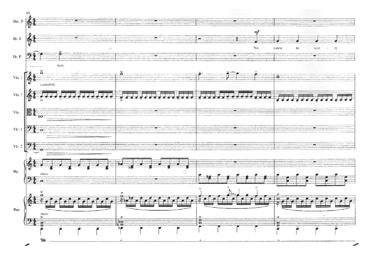
S]