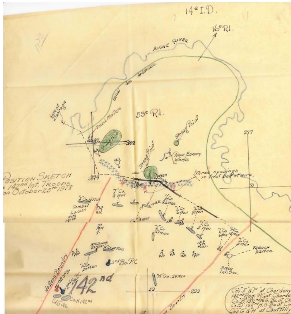
Figure 3. Assault on Forest Farm, October, 1918. NARA, RG 120, Records of the American Expeditionary Forces, 36 th Division, 142 nd Infantry Regiment, Box 14, Folder, Tracings Positions, October, 1918.

Texas waited to go “over the top” across muddy fields and into the teeth of the German main line of resistance across the horseshoe bend of the Aisne River. 65