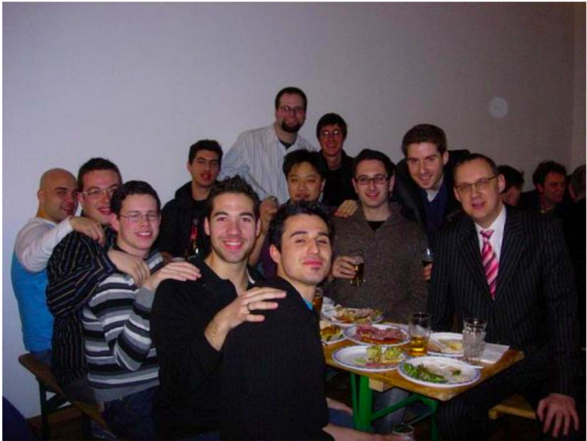
Figure 5: Teacher and trombone class enjoy a meal after a performance.