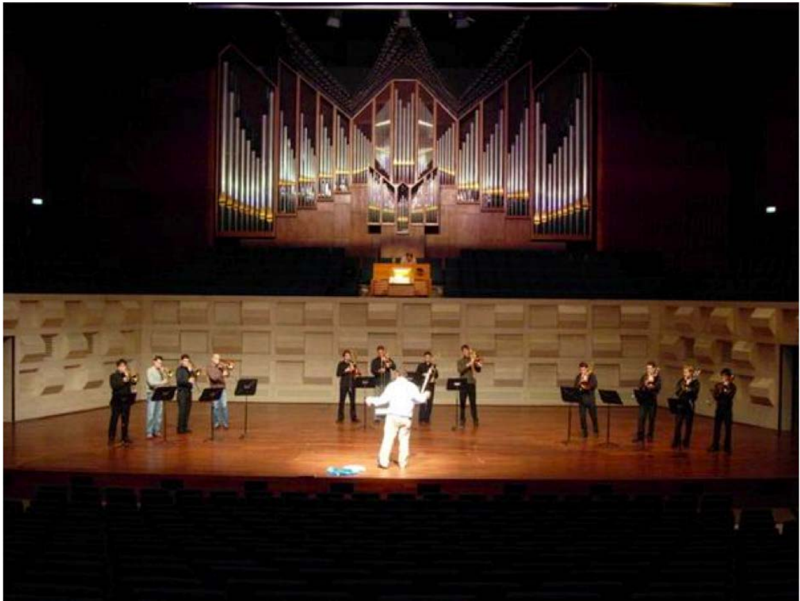
Figure 4: Rehearsing Gabrieli's Canzona XIII in the De Doelen Concertgebouw in Rotterdam.