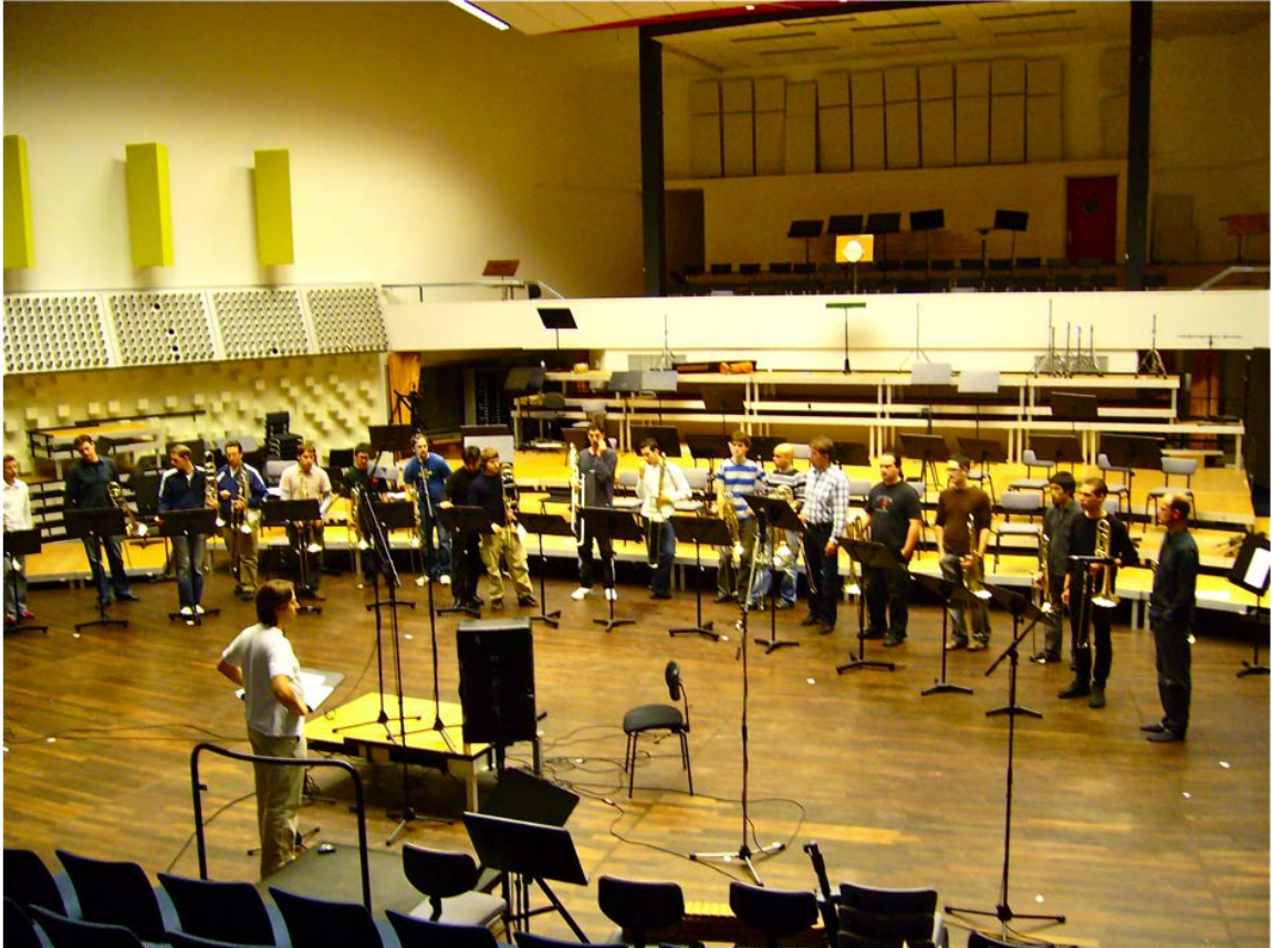
Figure 3: Recording Posaunenstadt by Ewazen during the 2006 camp and recording session at the MCO in Hilversum.